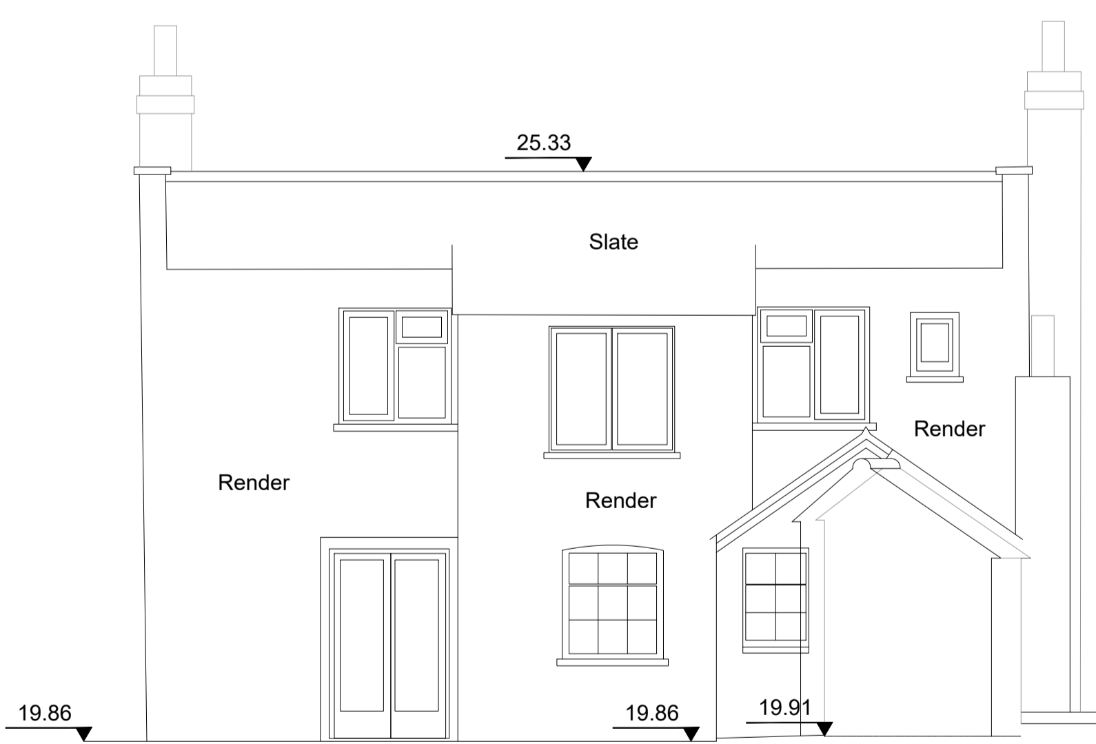
Datum 19.00m North Elevation

02 EXISTING SIDE ELEVATION 04-005 / 1:500A1