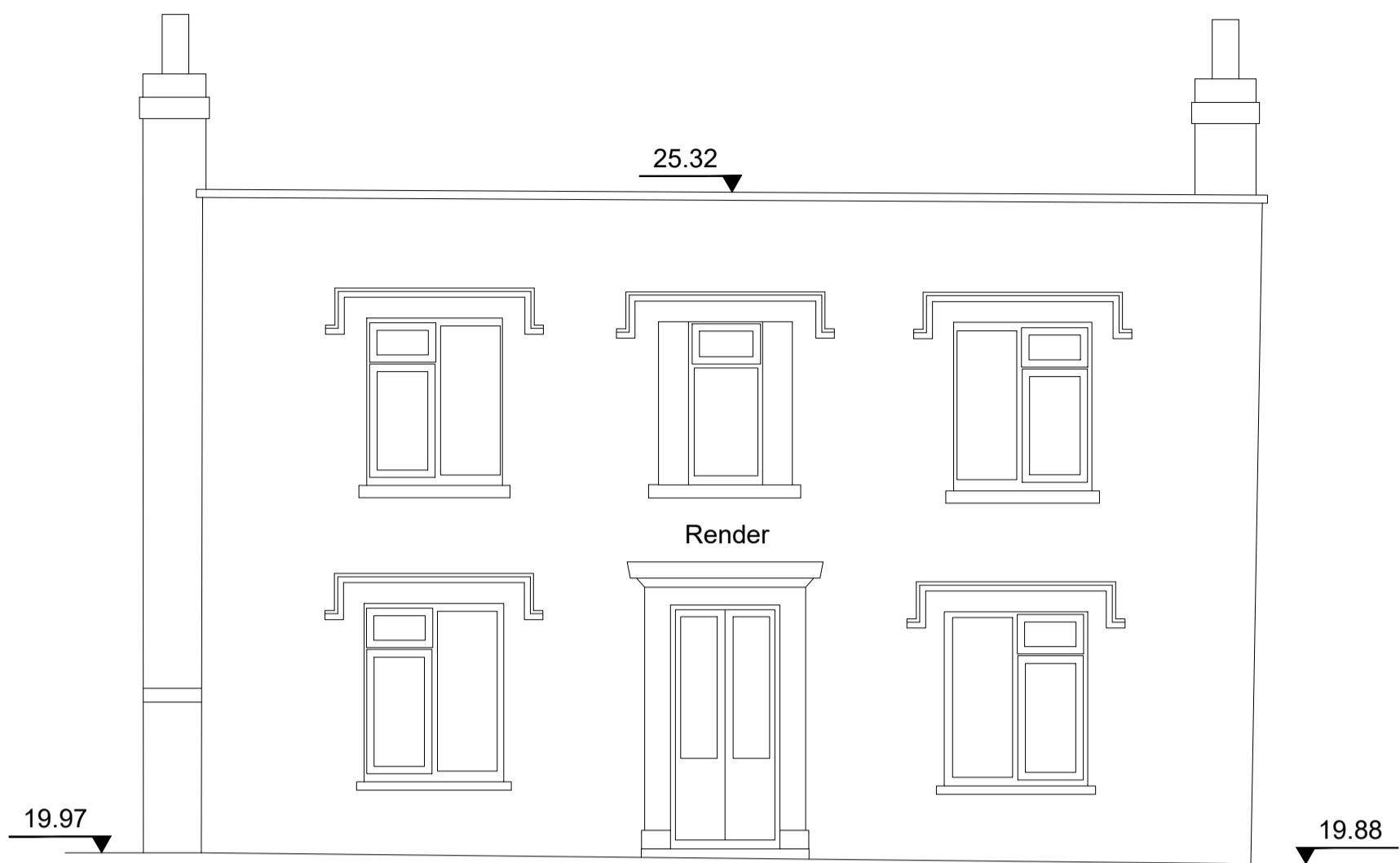
Datum 19.00m South Elevation

NOTES DRAWING REMAINS COPYRIGHT OF THE ARCHITECT.