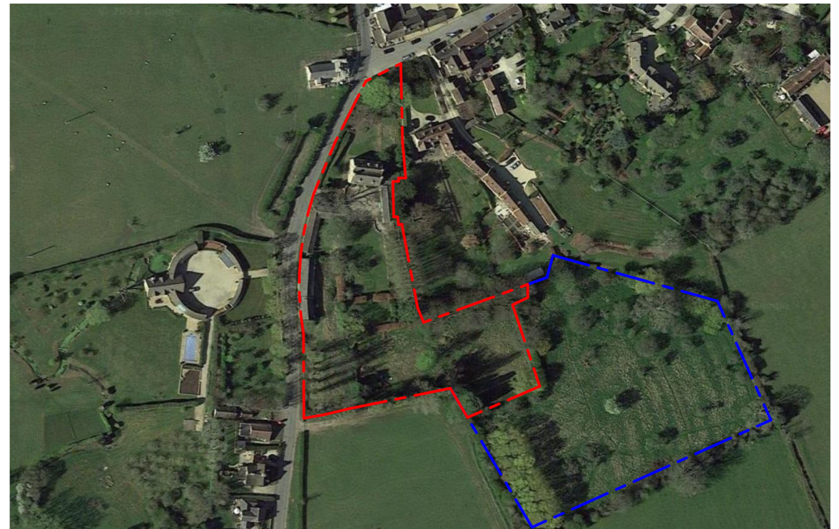
Aerial View - NOT TO SCALE