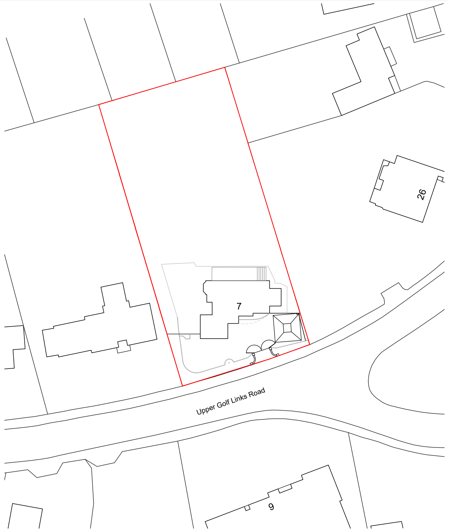
block plan 200