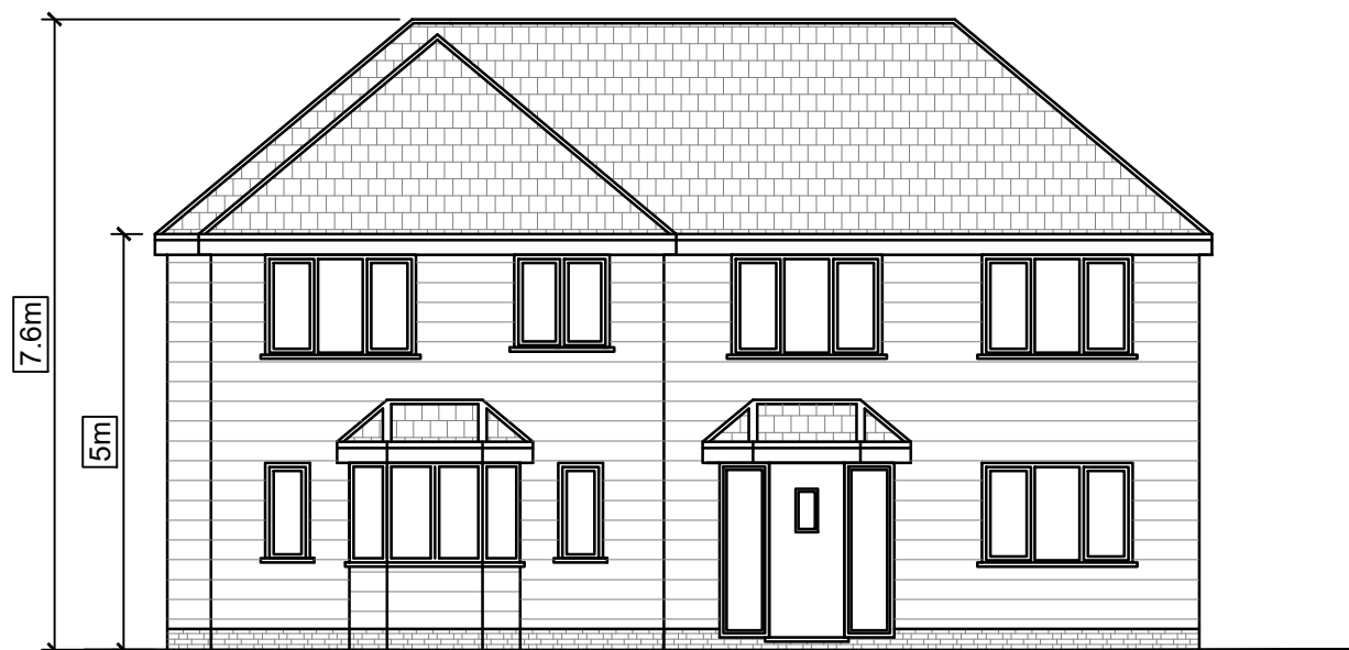
Indicative House Type (Plot 2) - Front Elevation