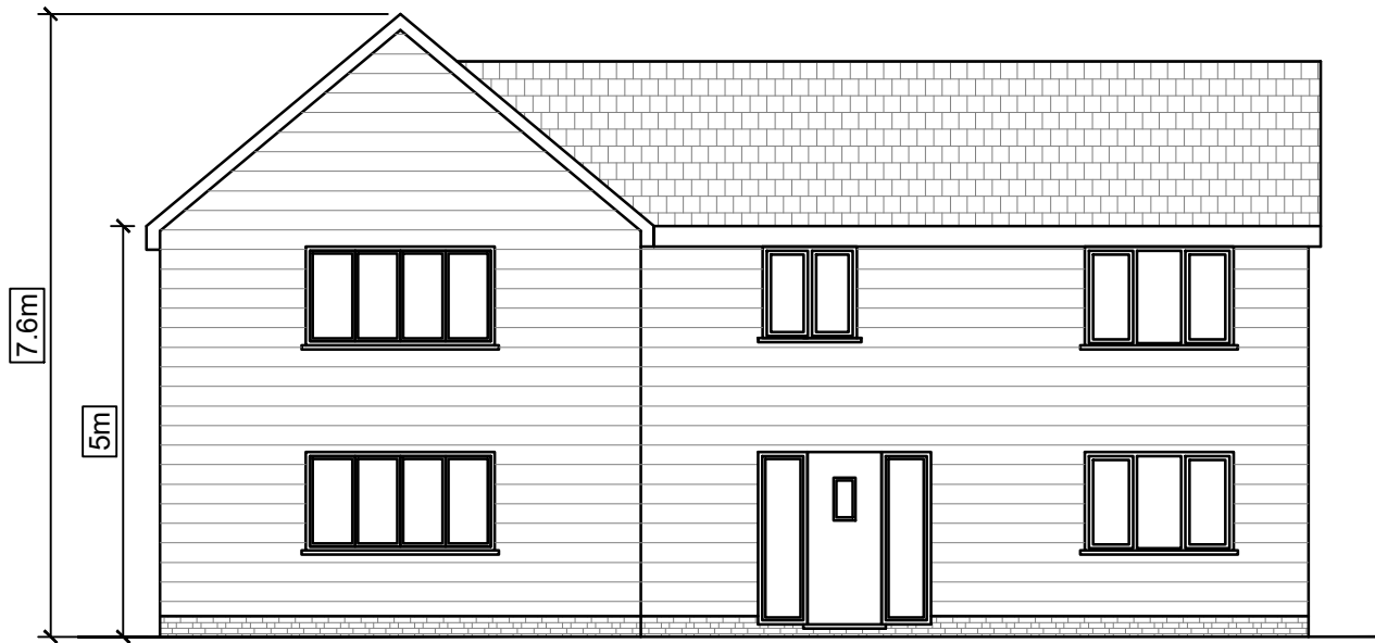
Indicative House Type (Plot 1 & 3) - Front Elevation