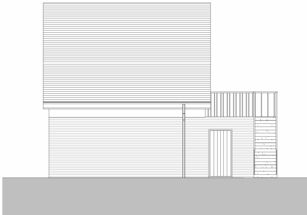
3 Garage South West Elevation P200 1:100