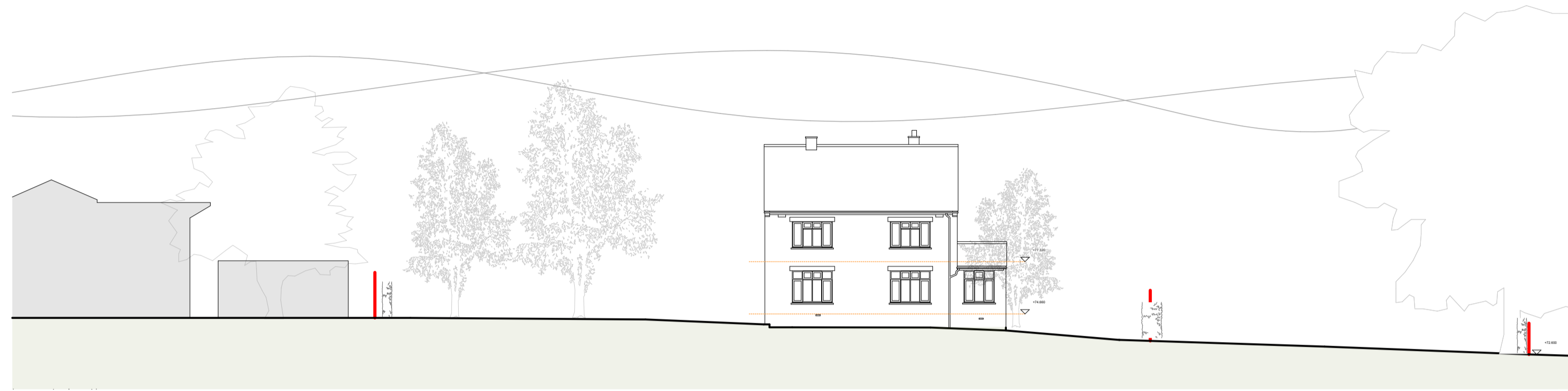
existing east elevation