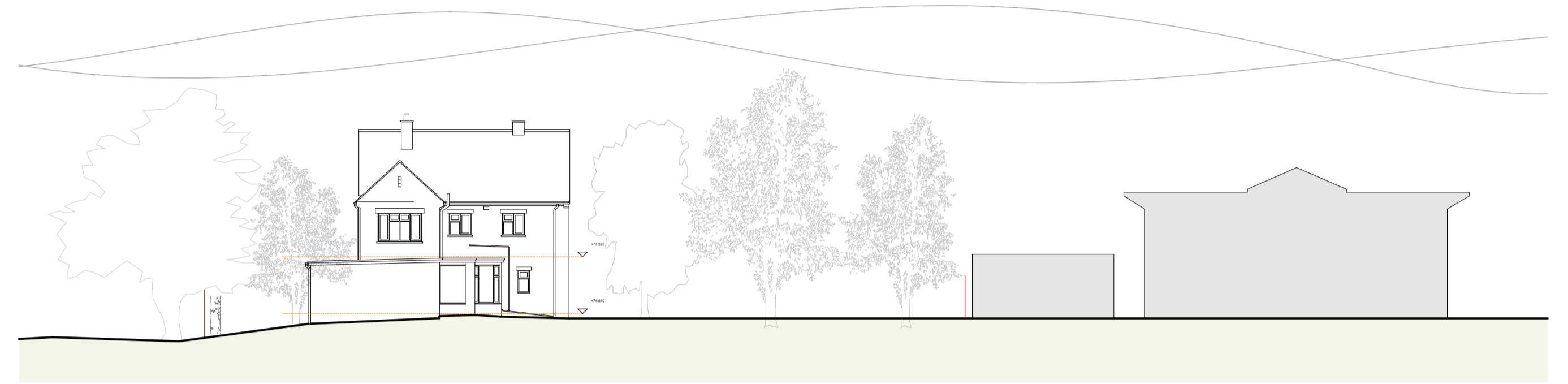
existing west elevation