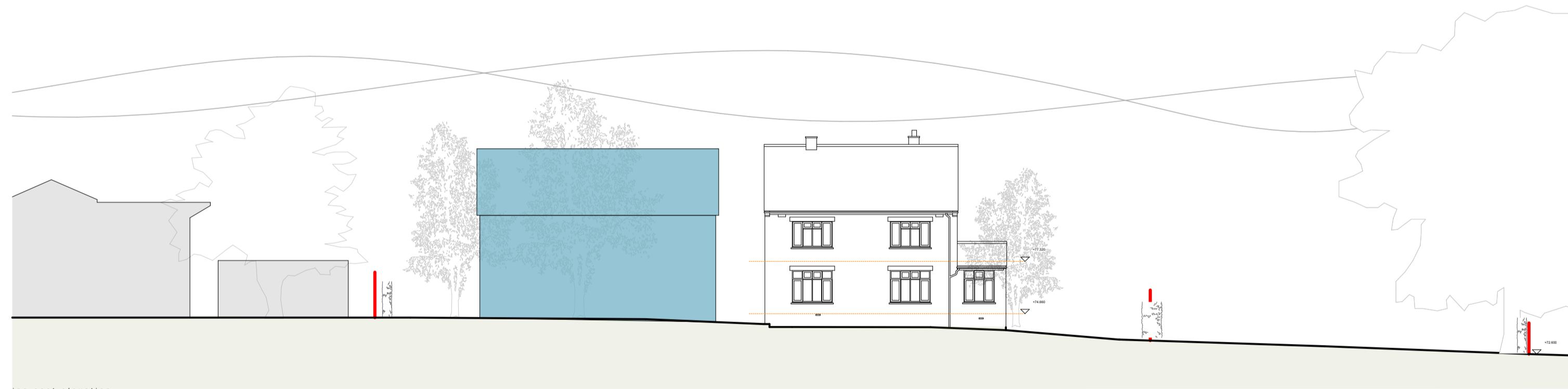
proposed east elevation