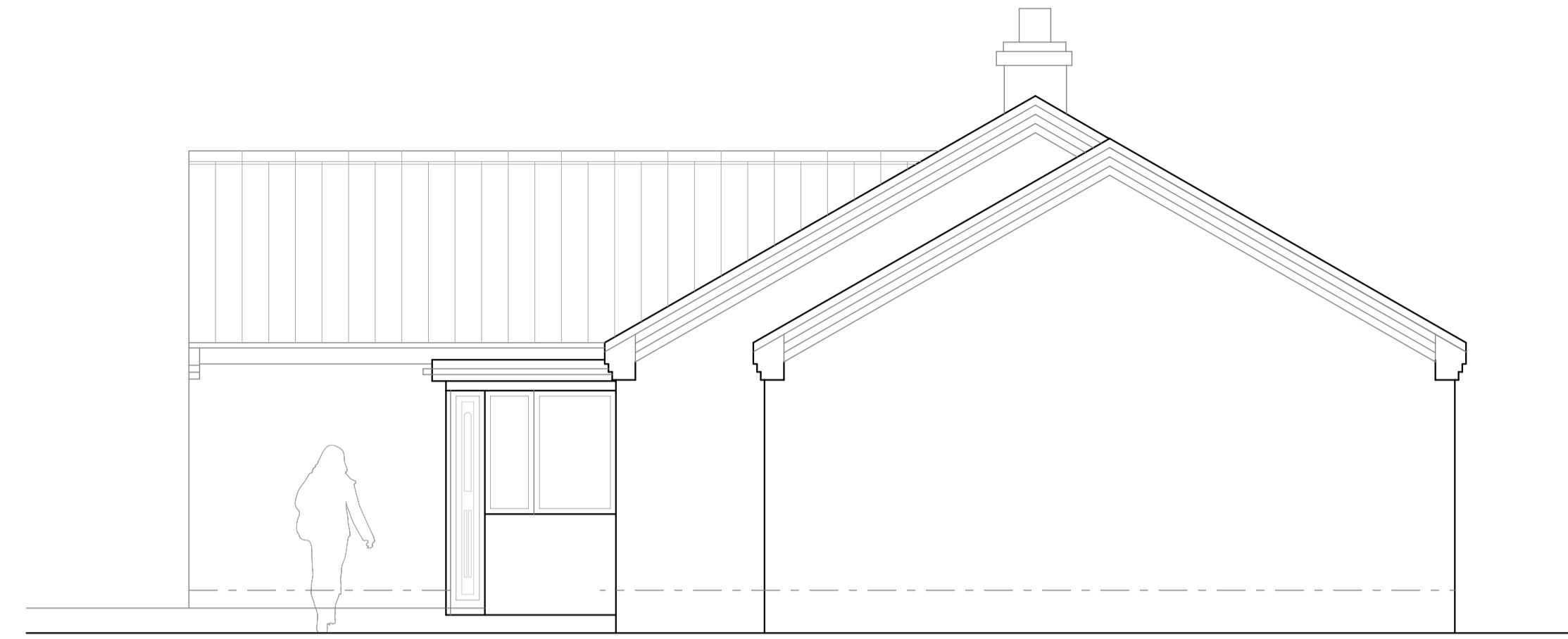
Side Elevation (West) - Existing scale 1:50