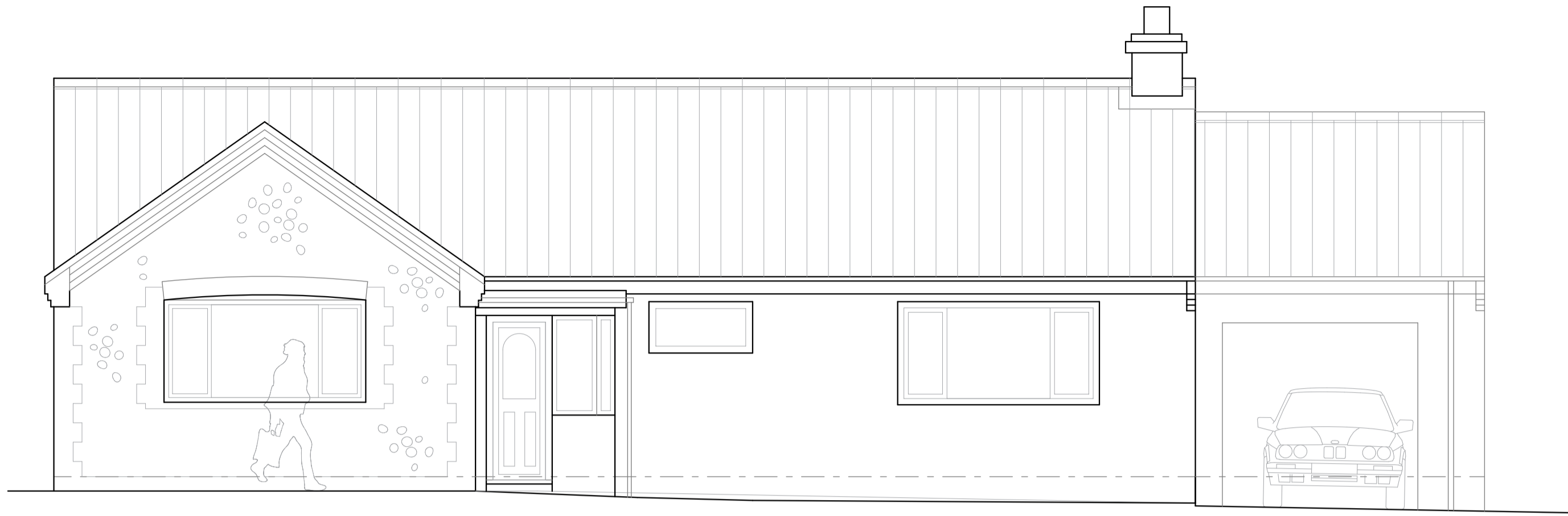
Front Elevation (North) - Existing scale 1:50