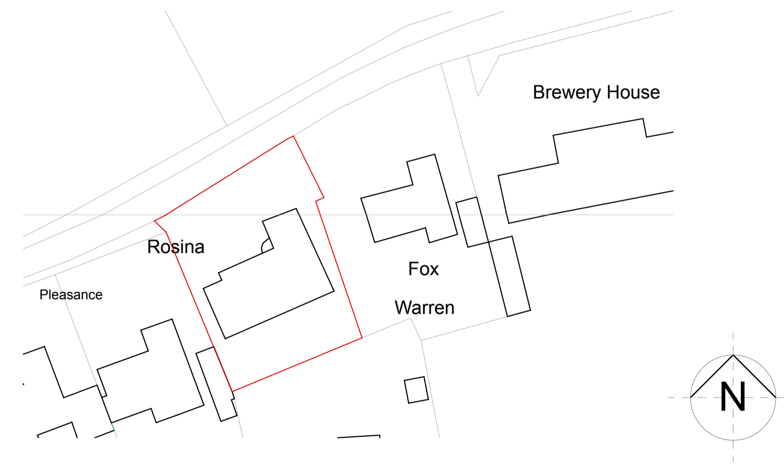
Site Plan - Existing scale 1:500