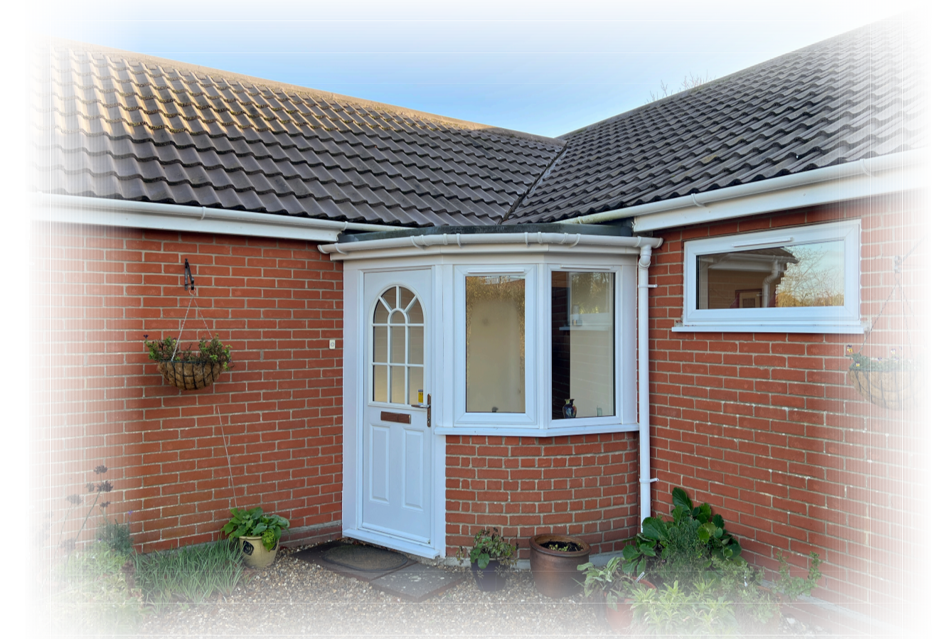
Photograph of Porch - Existing scale - Photo taken on site.