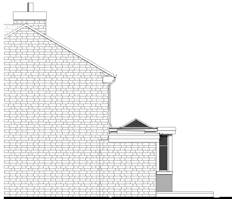
Proposed North Elevation 1 : 100