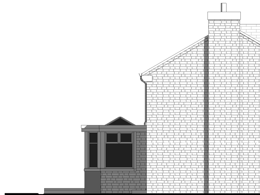
Proposed South Elevation 1 : 100