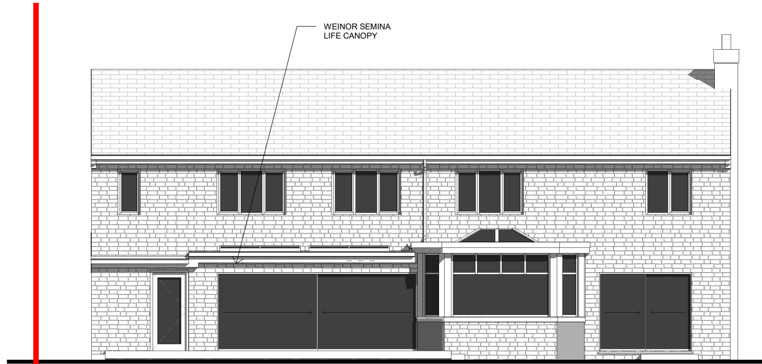
Proposed West Elevation 1 : 100