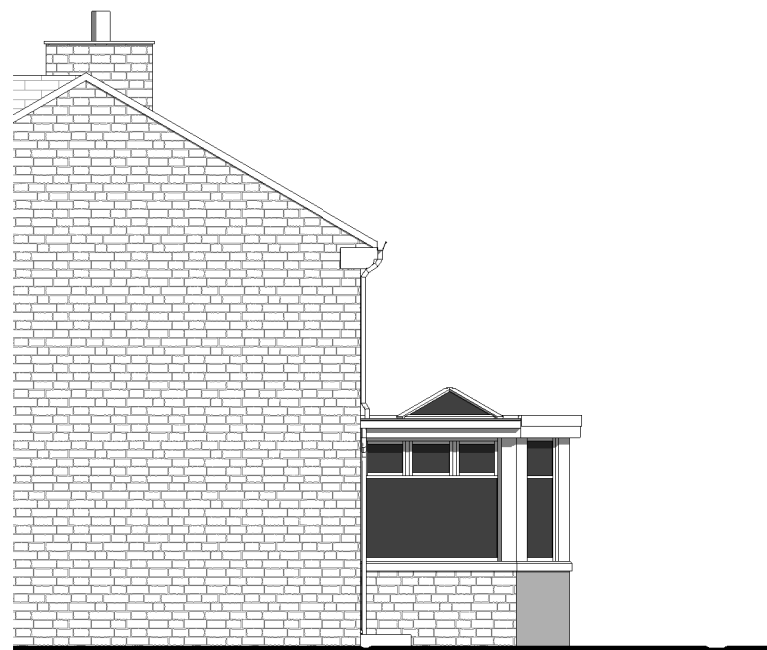
Existing North Elevation 1 : 100