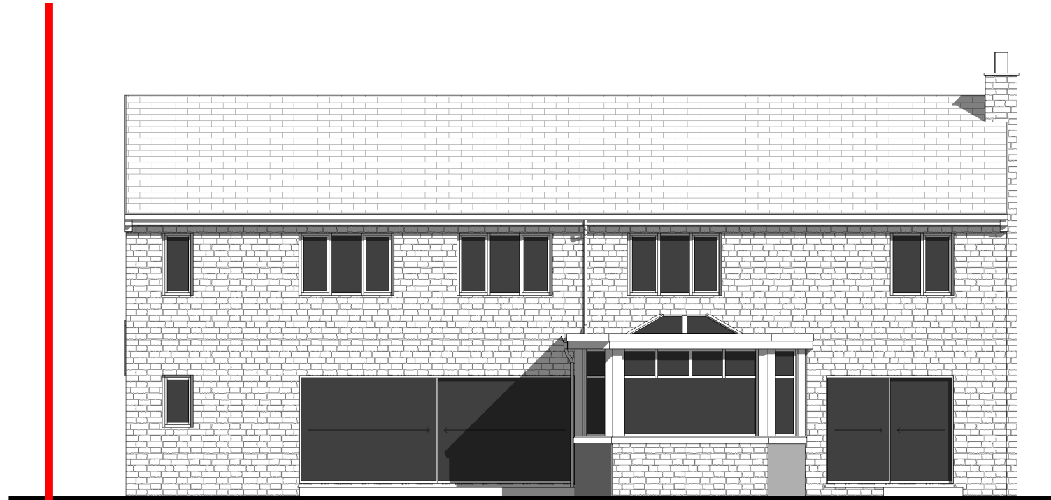
Existing West Elevation 1 : 100