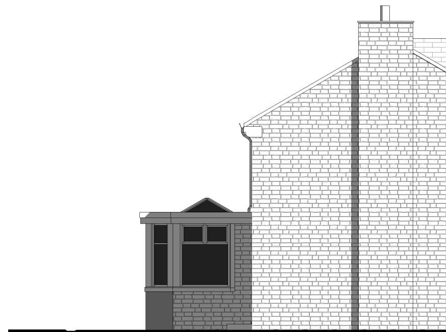
Existing South Elevation 1 : 100