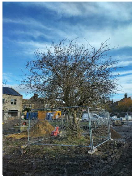
Photo 4: T13 and installed tree protection fencing, from south west (November 2023)