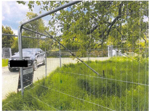
Photo 16: T18 and installed tree protection fencing, from north (July 2023)