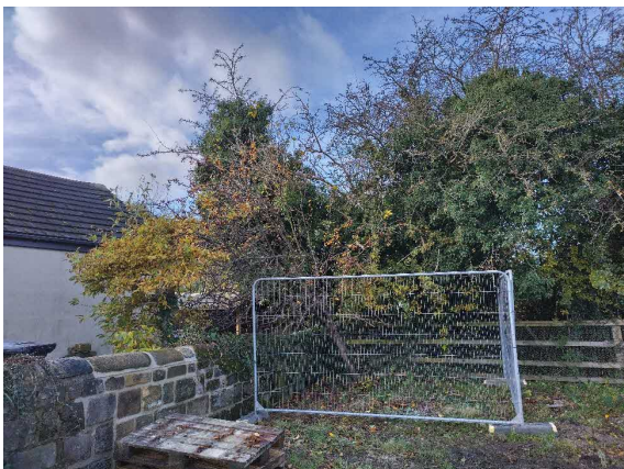
Photo 5: T14 and installed tree protection fencing, from north east (November 2023)