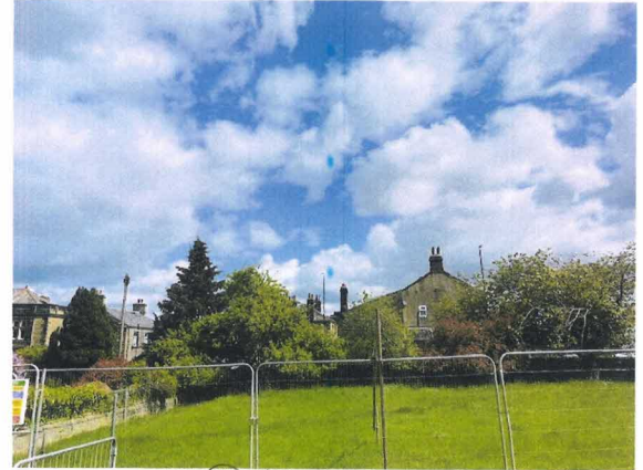
Photo 12: T5 to T8 and installed tree protection fencing, from west (July 2023)