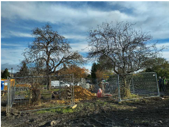
Photo 3: T13 and T15 and installed tree protection fencing, from west (November 2023)