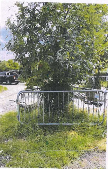
Photo 17: T15 and installed tree protection fencing, from west (July 2023)