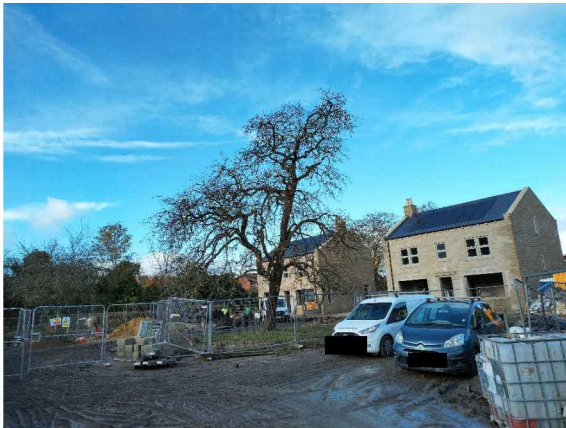
Photo 9: T18 and installed tree protection fencing, from south east (November 2023)