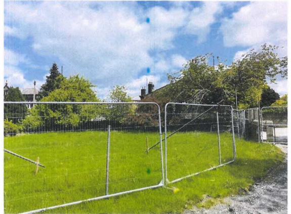
Photo 14: T5 to T8 and installed tree protection fencing, from south west (July 2023)