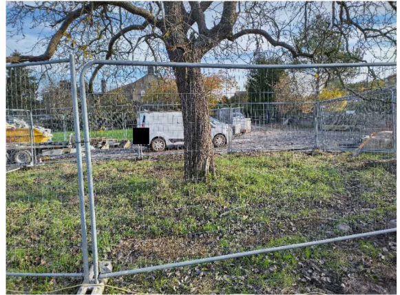
Photo 8: T18 and installed tree protection fencing, from west (November 2023)