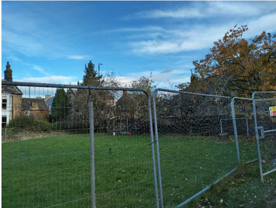
Photo 1: T5 to T8 and installed tree protection fencing, from south west (November 2023)