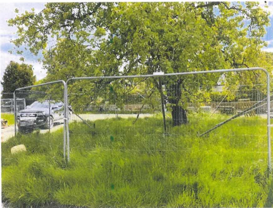
Photo 15: T18 and installed tree protection fencing, from north west (July 2023)