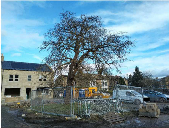
Photo 7: T18 and installed tree protection fencing, from south west (November 2023)