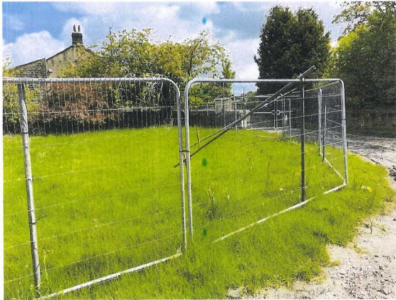
Photo 13: T5 to T8 and installed tree protection fencing, from south west (July 2023)