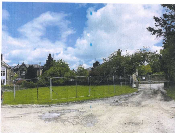
Photo 11: T5 to T8 and installed tree protection fencing, from south west (July 2023)