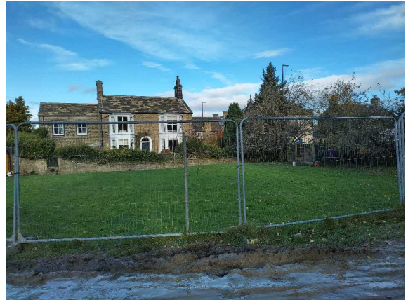
Photo 2: T5 to T8 and installed tree protection fencing, from south west (November 2023)