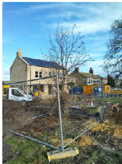
Photo 6: T15 and installed tree protection fencing, from south west (November 2023)