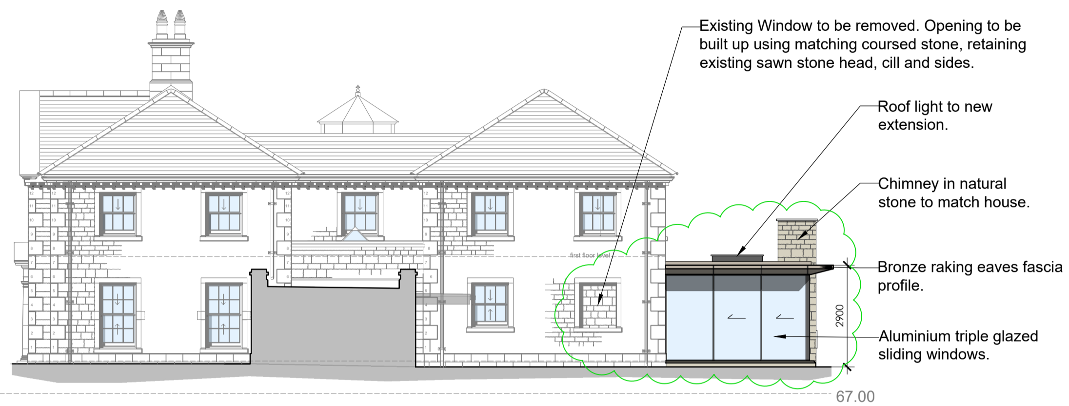
Proposed Elevation B - NE