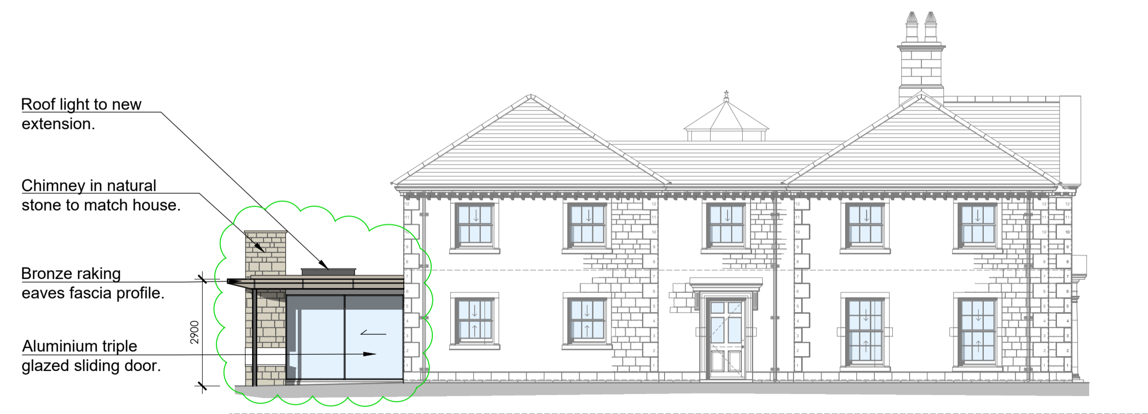
Proposed Elevation D - SW