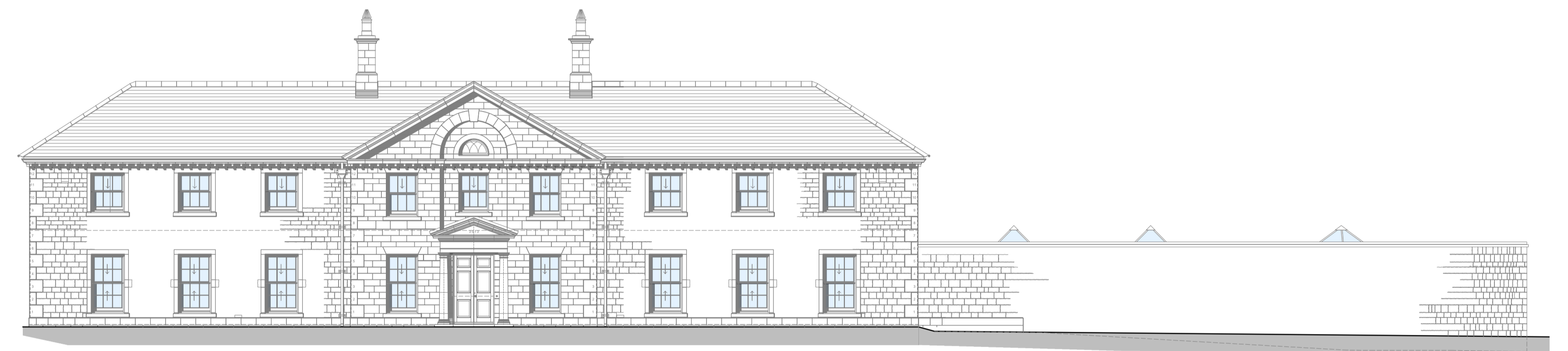
Proposed Elevation C - SE