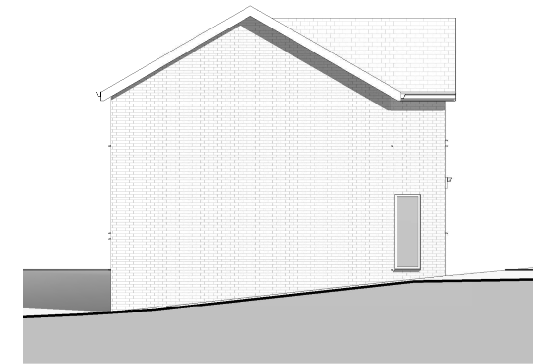
6 South West Elevation Scale - 1 : 100