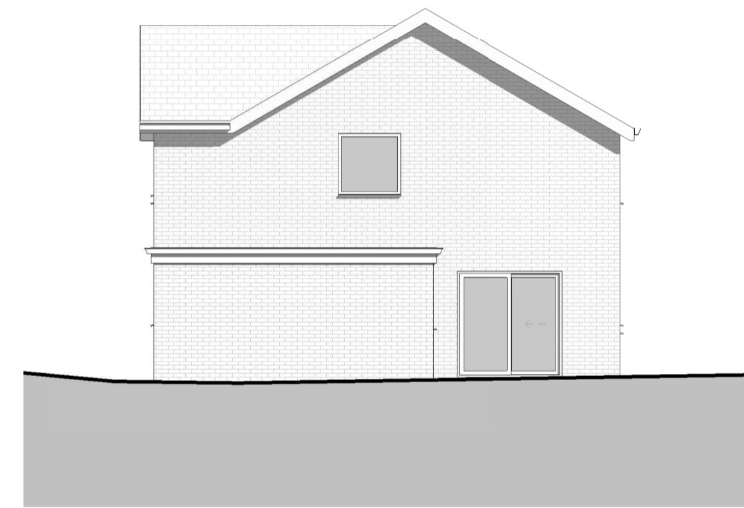
4 North East Elevation Scale - 1 : 100