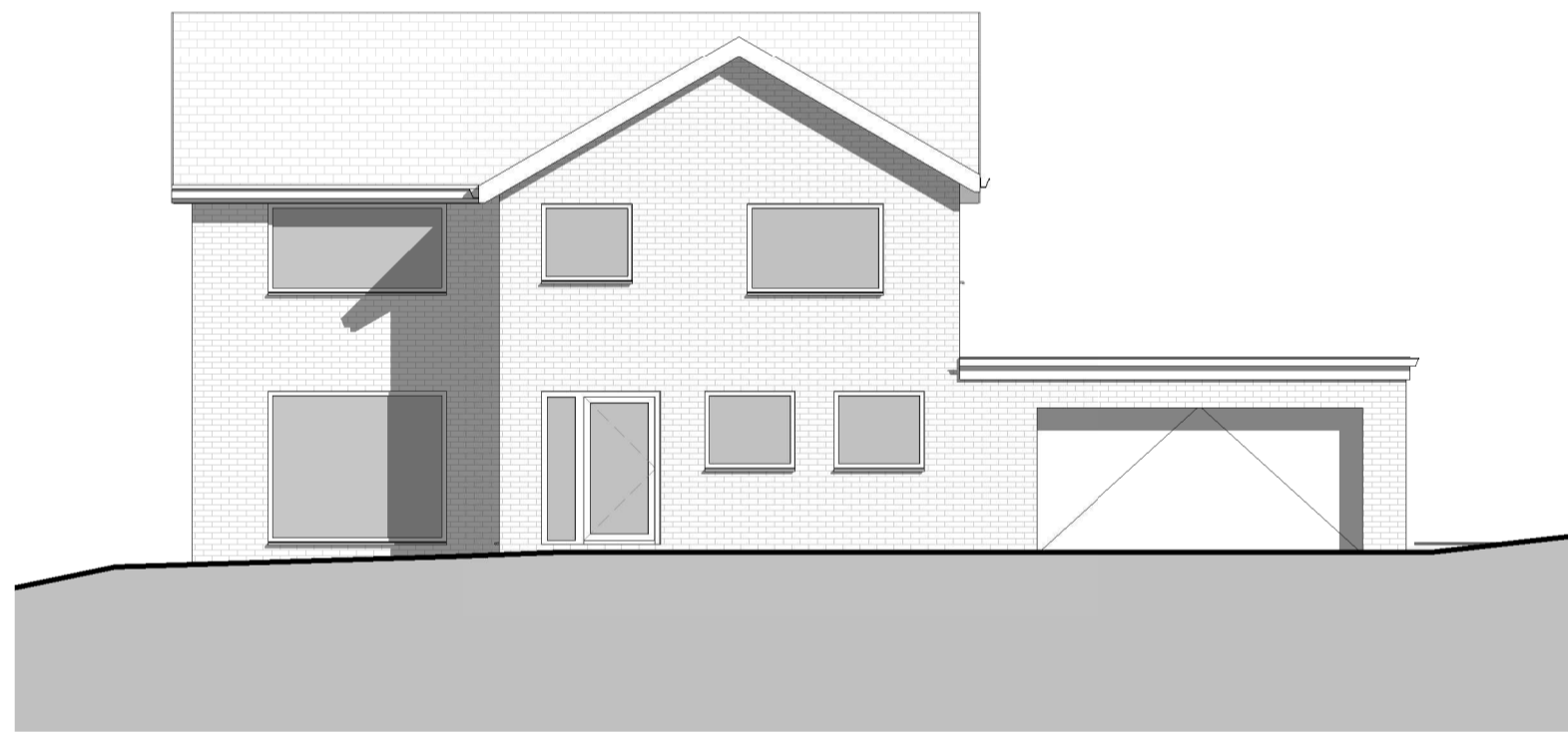
3 North West Elevation Scale - 1 : 100