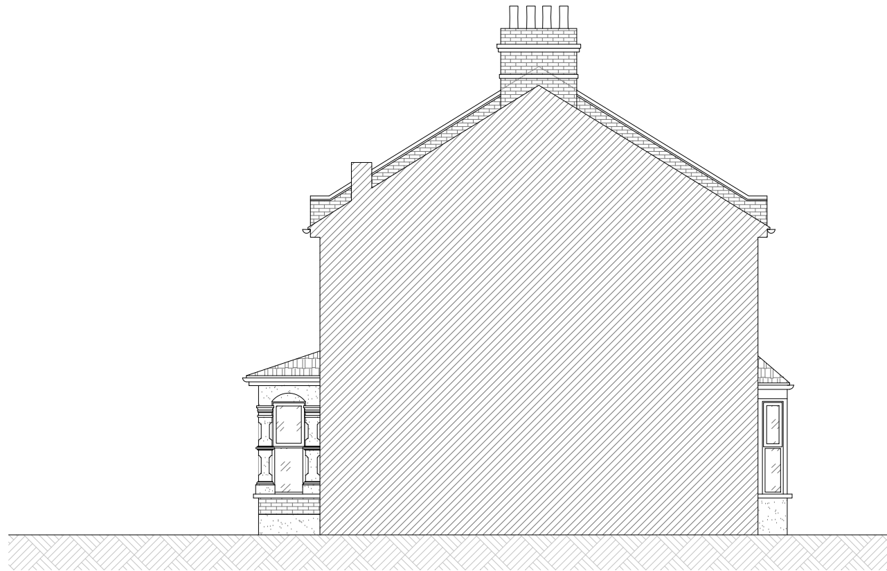
EXISTING SIDE ELEVATION - B scale 1:100