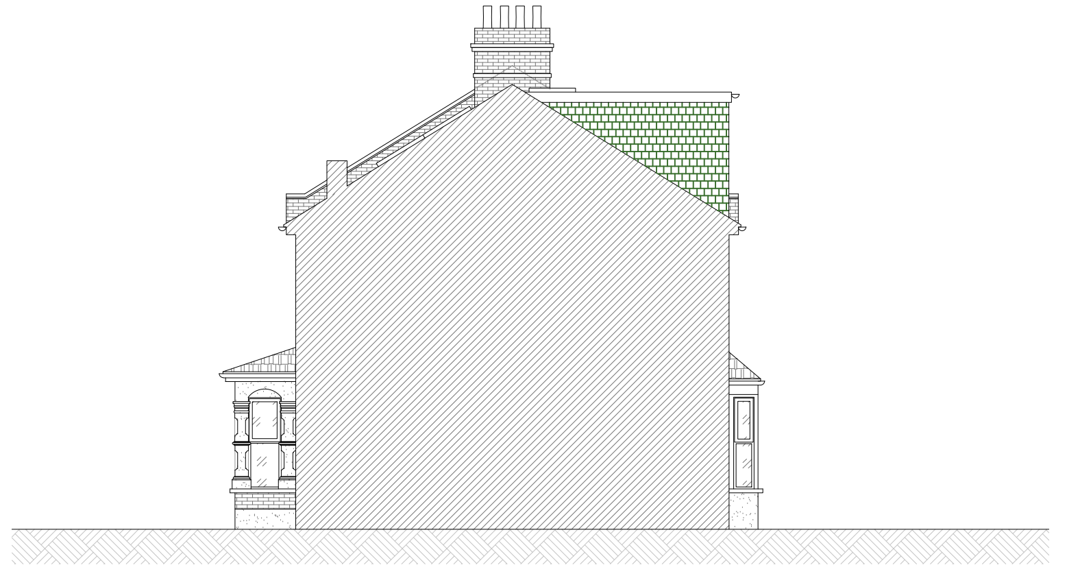
PROPOSED SIDE ELEVATION - B scale 1:100