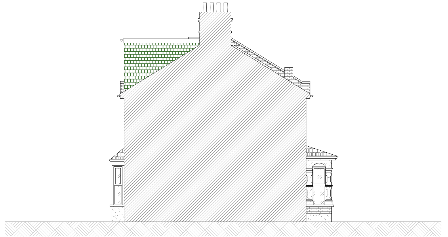
PROPOSED SIDE ELEVATION - A scale 1:100