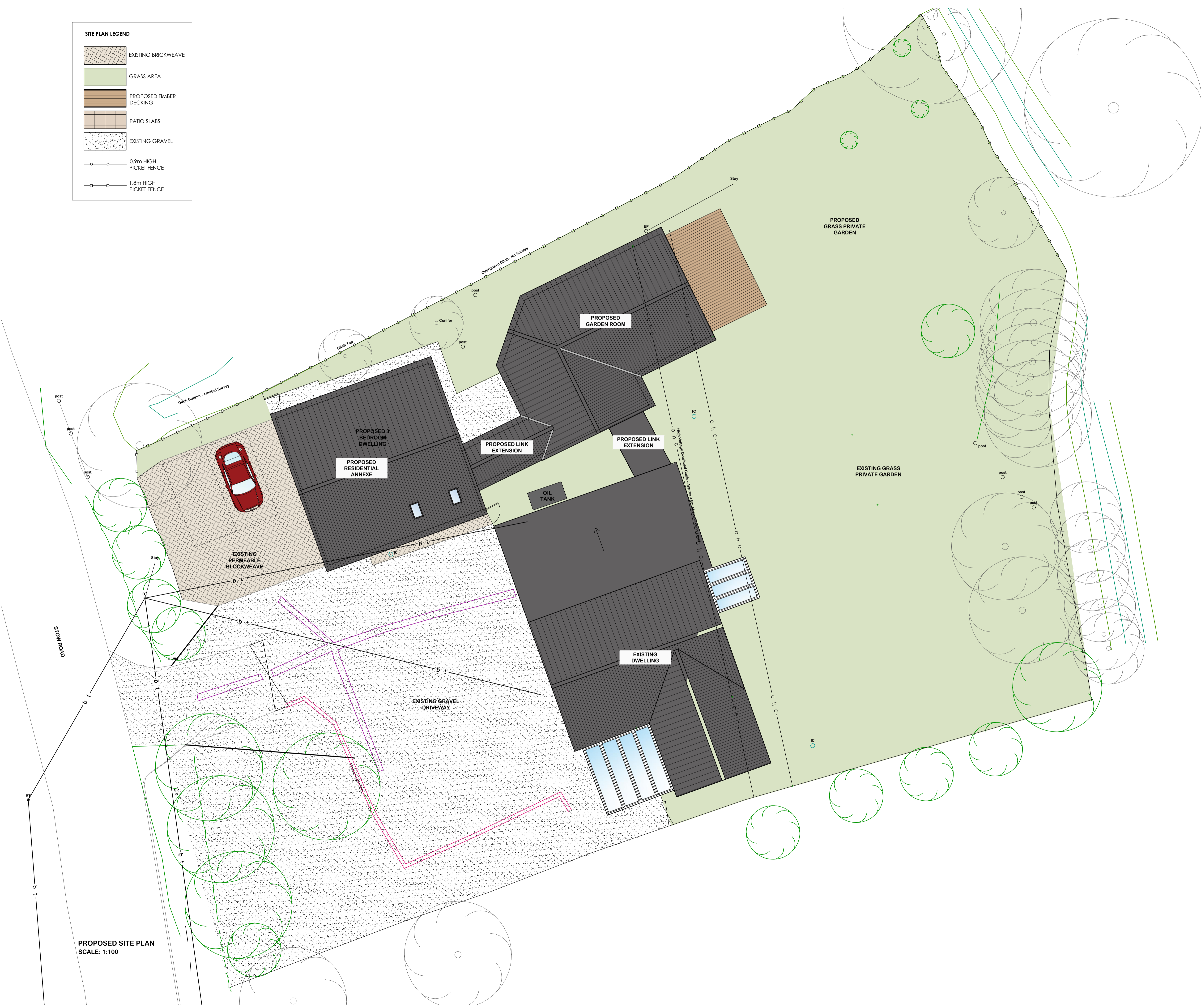
PROPOSED SITE PLAN SCALE: 1:100

Notes: This document is the property of David Trundle Design Services Ltd and may not be reissued, loaned or copied in part or in whole without written permission © 2022 All dimensions are in millimetres unless stated otherwise. It is recommended that information is not scaled off this drawing. This drawing should be read in conjunction with all other relevant information, specifications & schedules. If this drawing is received electronically it is the recipient's responsibility to print the document at the correct scale. All dimensions to be checked on site prior to commencing work and any discrepancies to be advised immediately. CONSTRUCTION (Design & Management) REGULATIONS 2015: David Trundle Design Services Ltd are employed as 'Designer' and will provide information to those responsible for the 'Principal Designer' and to the client. David Trundle Design Services Ltd are responsible for the 'Architectural' design of the elements included on this drawing only. Architectural design has been carried out with due consideration for the safety during construction, occupation and maintenance of the finished structure. The works contain no extraordinary hazards or risks that are not present during routine construction operations that would not readily be apparent to a competent contractor. This information should be included as part or commencement of the Health and safety file for the project.