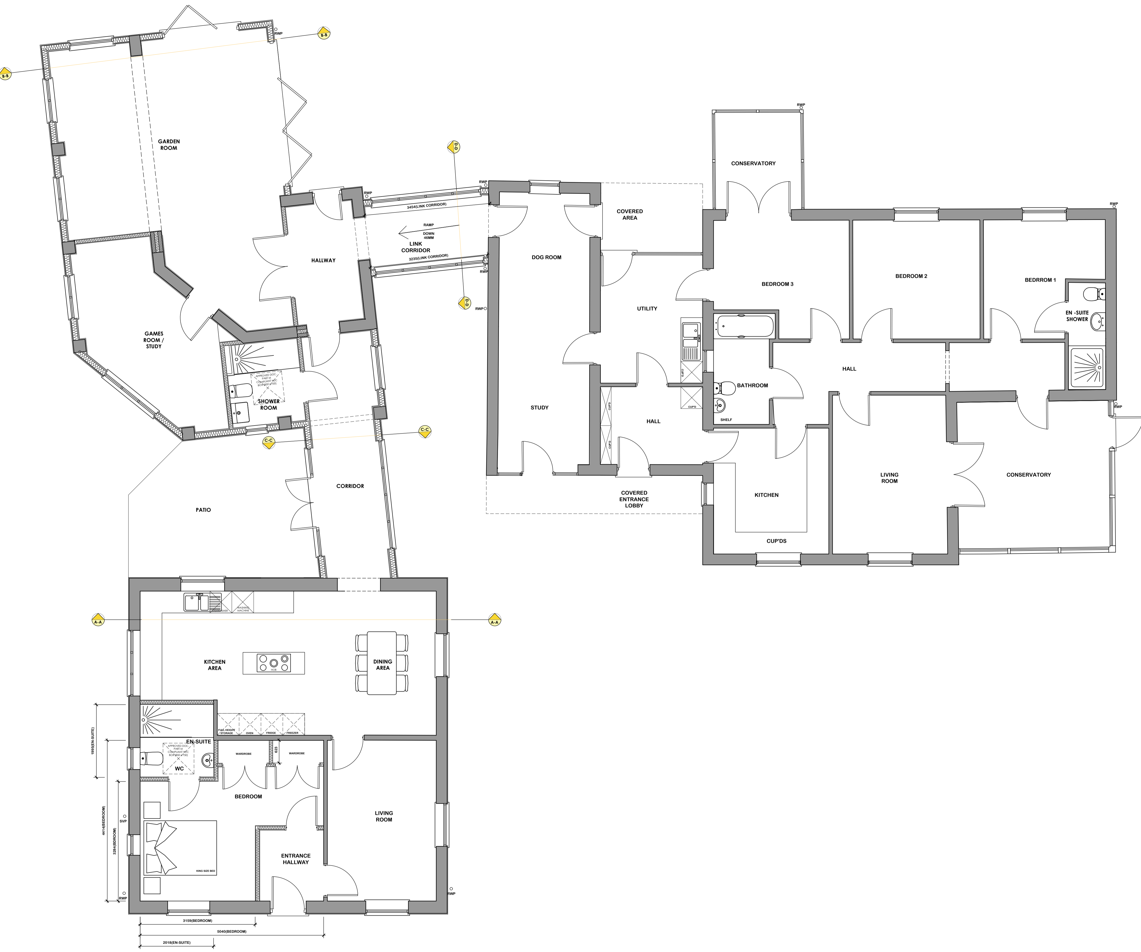
PROPOSED GROUND FLOOR PLAN SCALE: 1:50