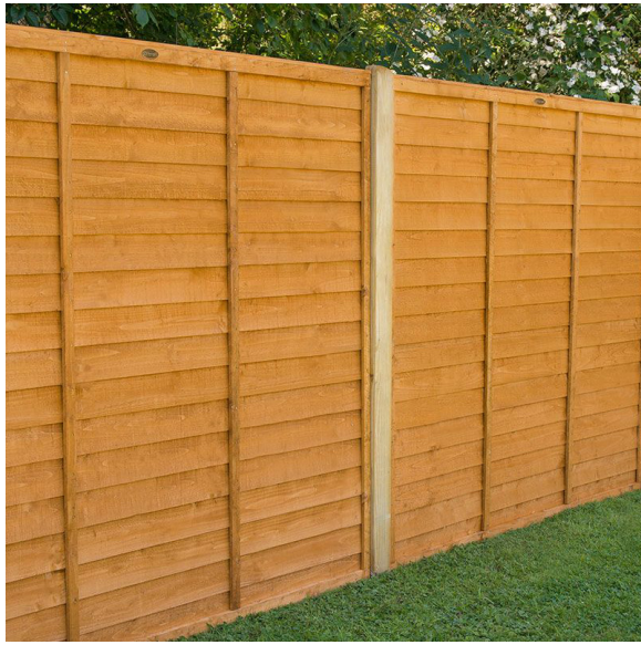
TIMBER BOUNDARY FENCE