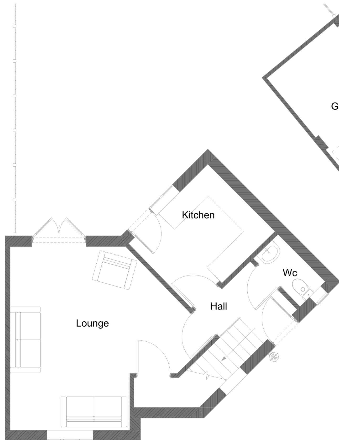
Ground Floor Layout 1:50

Copyright of this drawing belongs to SJI Designs Ltd and no part may be reproduced or utilised in any way whatsoever without prior written consent of SJI Designs Ltd.