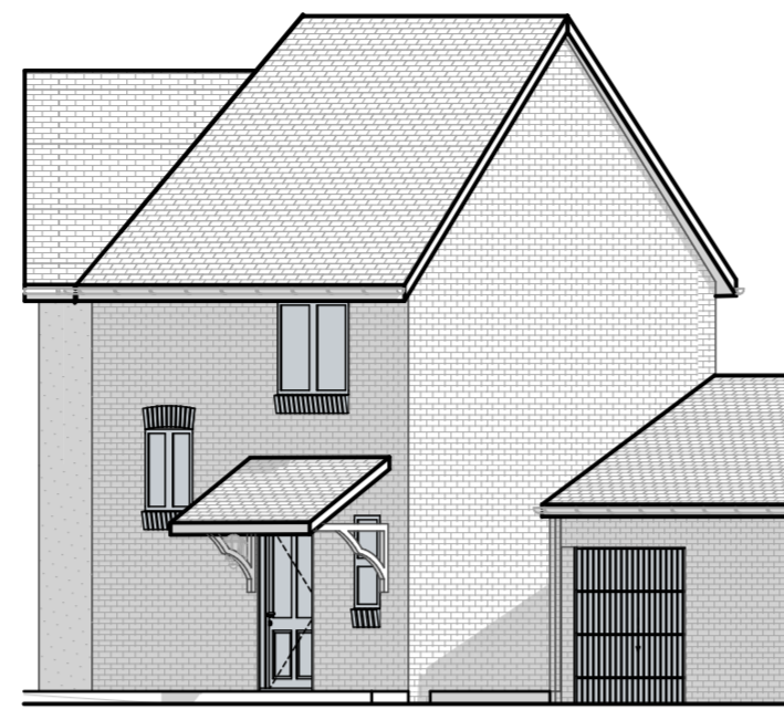
South Elevation 1:100