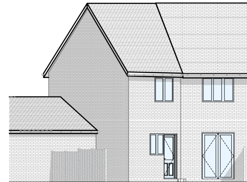
East Elevation 1:100