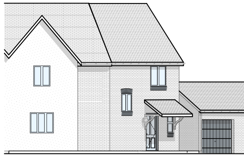
West Elevation 1:100