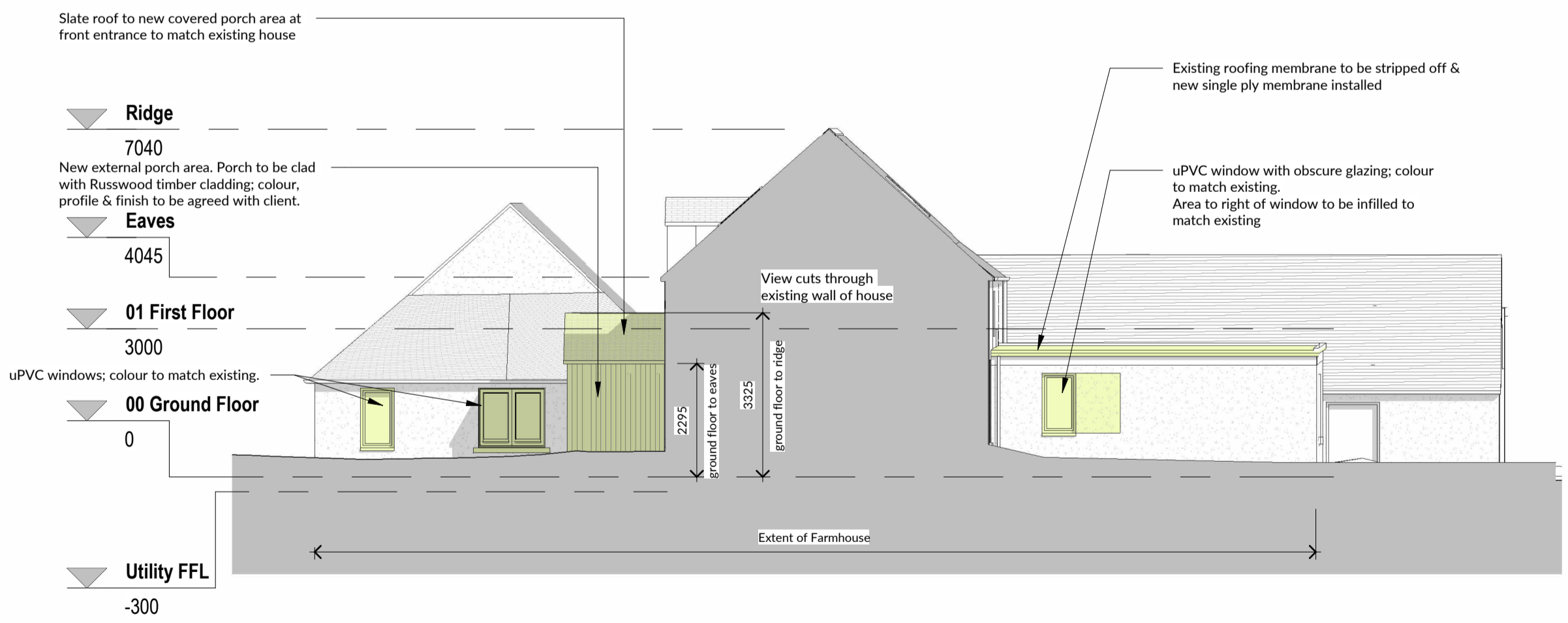
2 Proposed Right Side Elevation 1:100