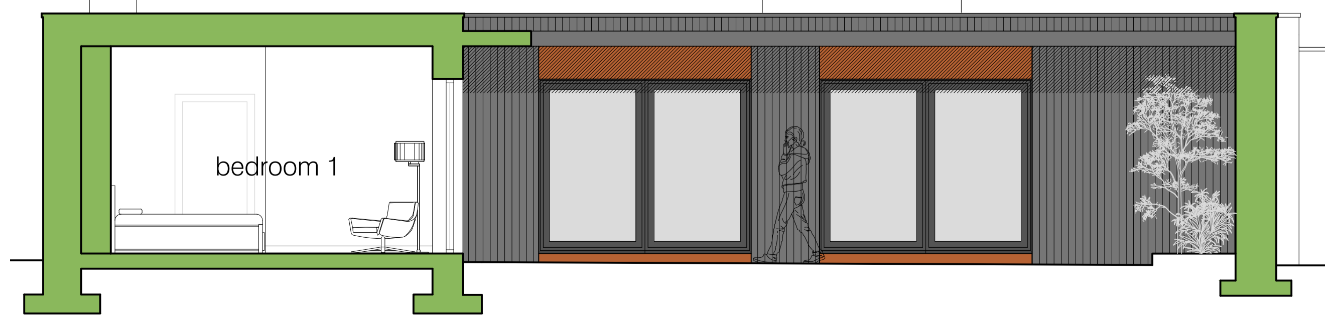
proposed cross section a-a scale 1:50