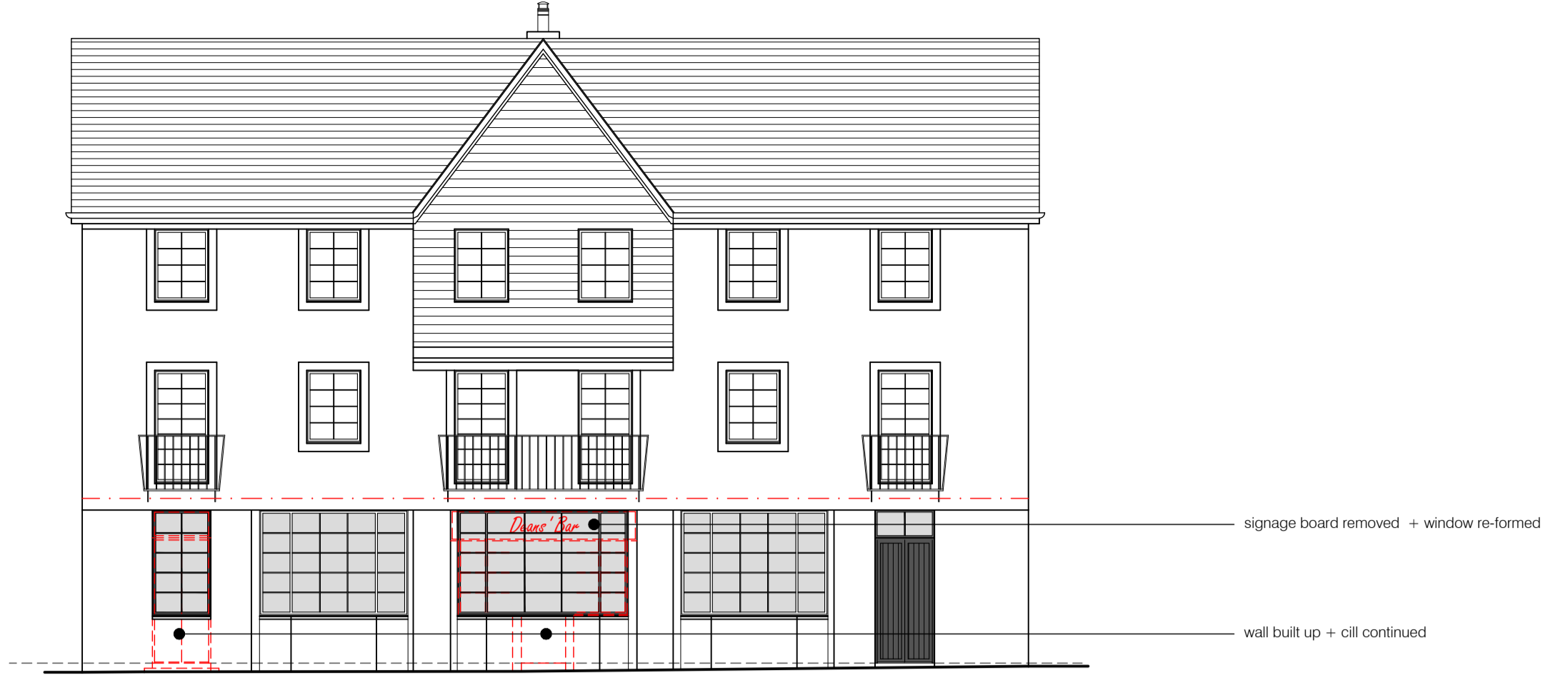
proposed front elevation scale 1:100