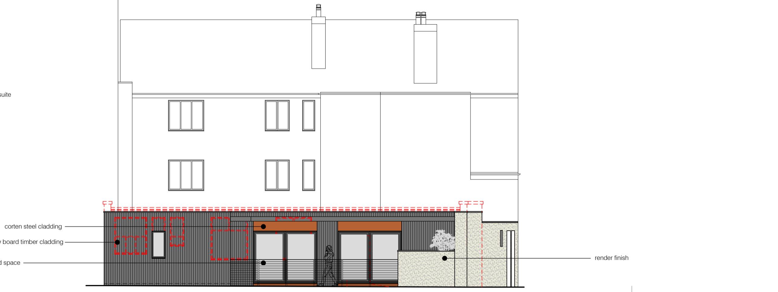
proposed rear elevation scale 1:100