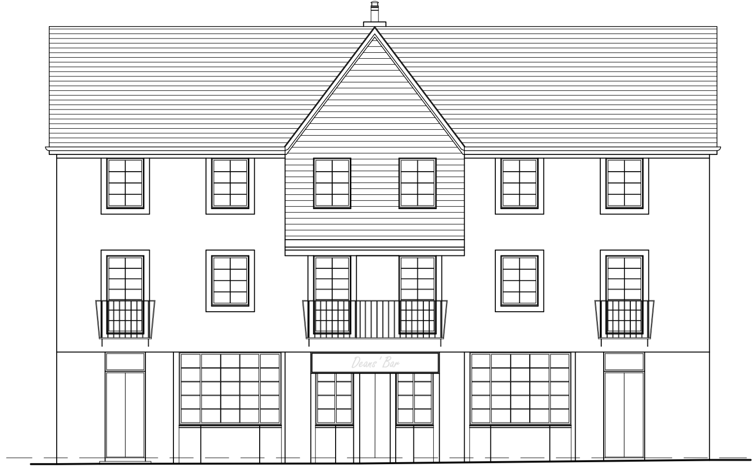
existing front elevation scale 1:100