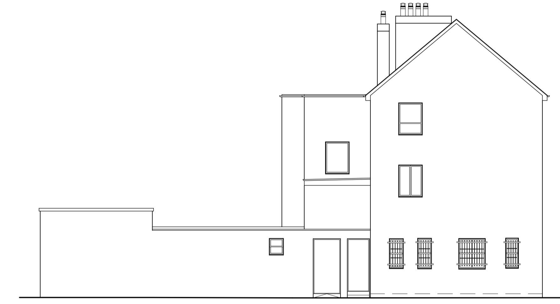
existing side elevation scale 1:100