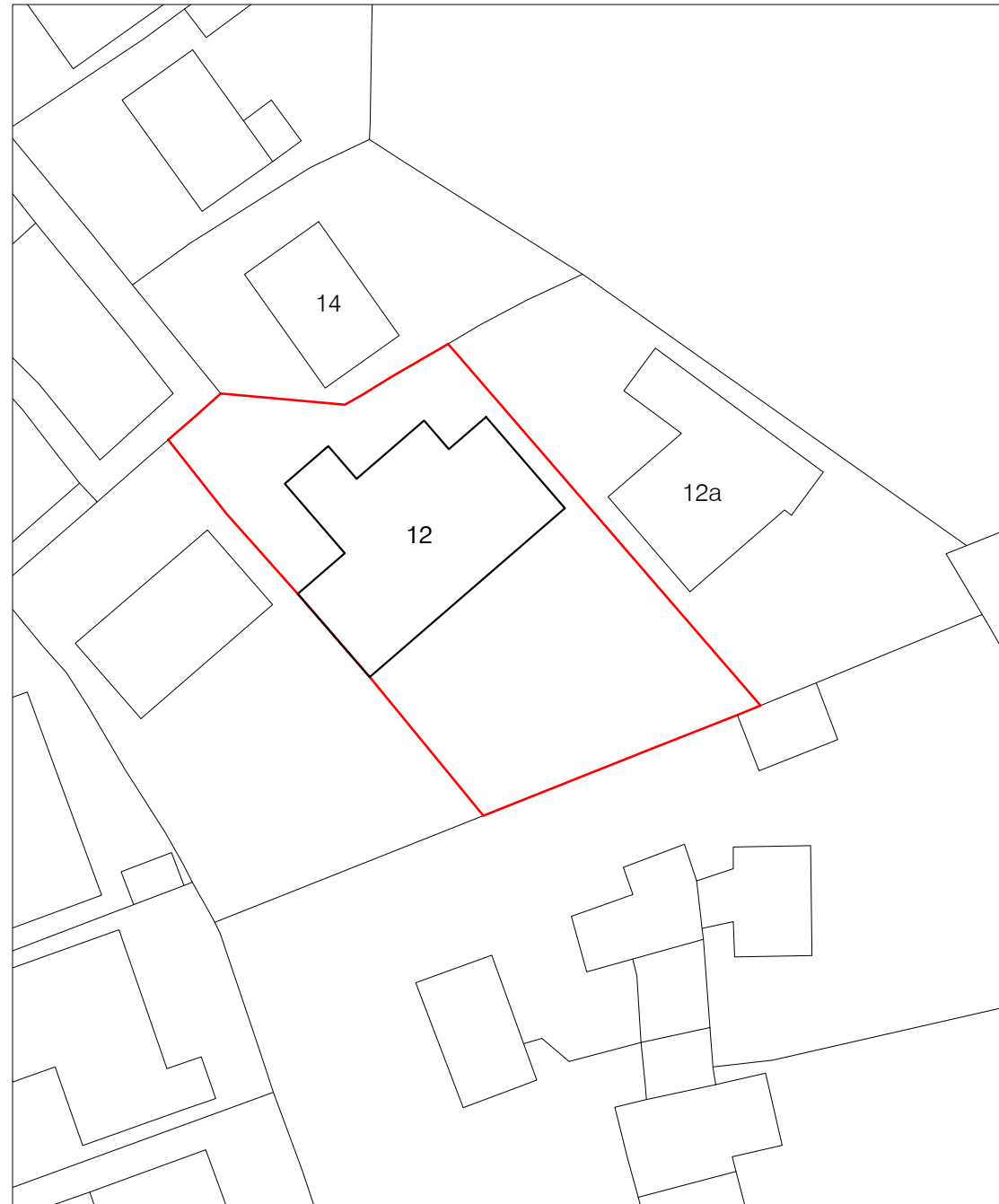
Existing - SITE PLAN (BLOCK PLAN) 1:500