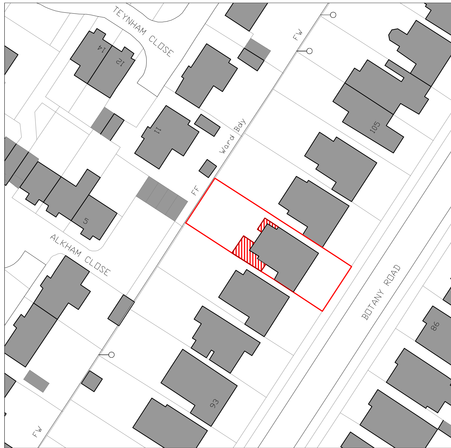
02 SITE BLOCK PLAN Scale: 1:500 @ A3