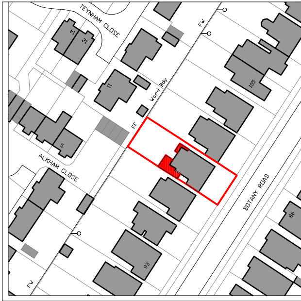
01 SITE O.S. LOCATION PLAN Scale: 1:1250 @ A3