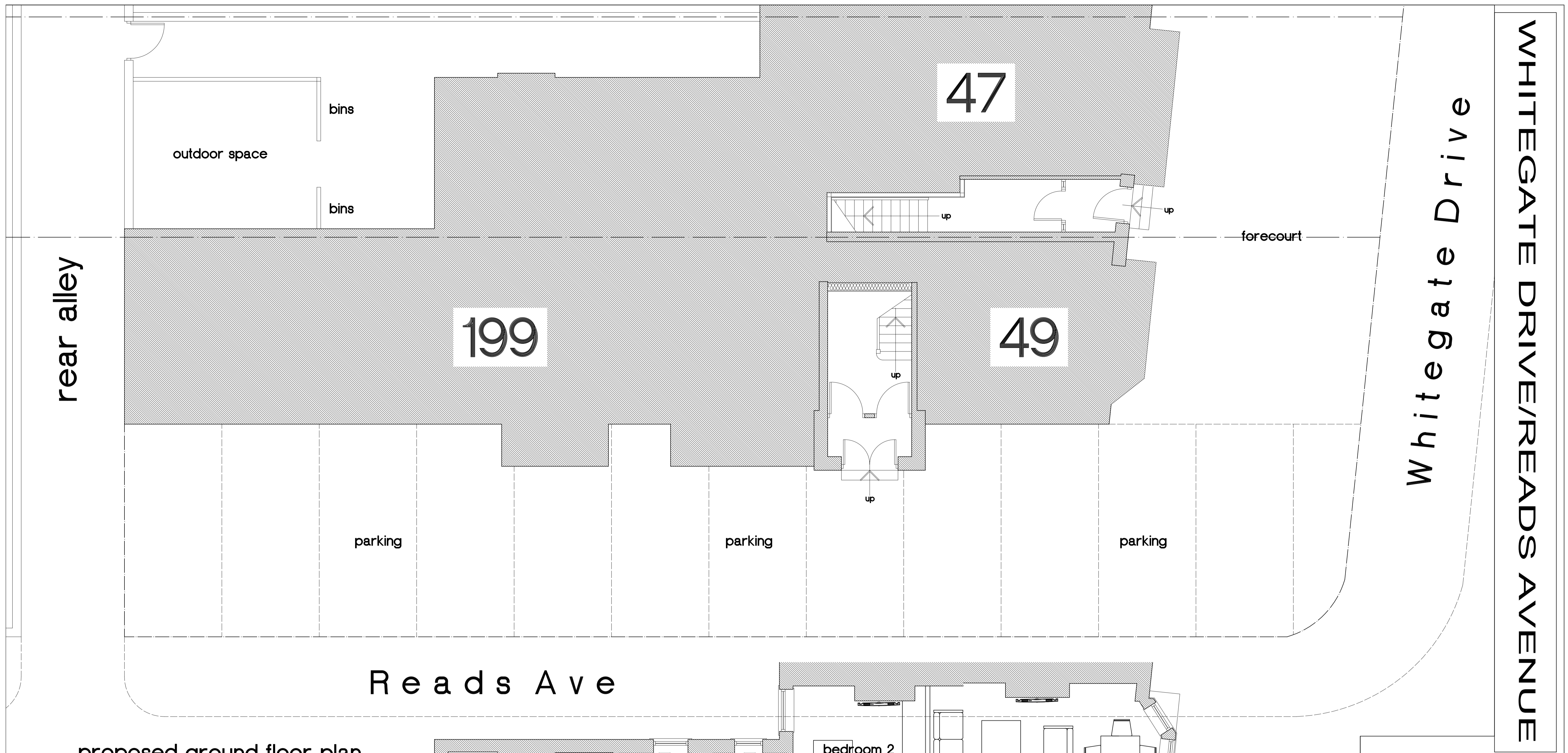
proposed ground floor plan