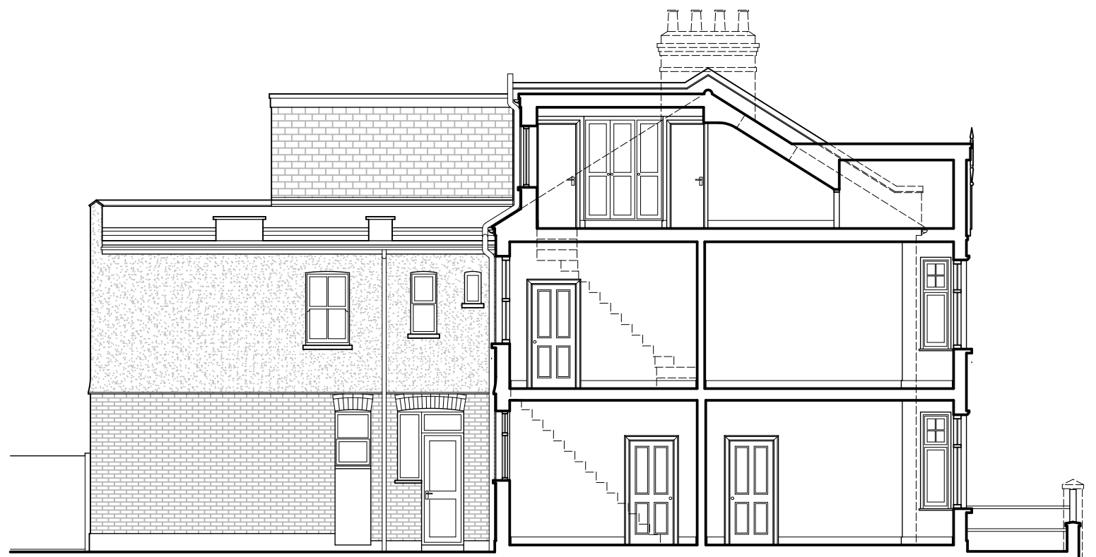
4 - SECTION