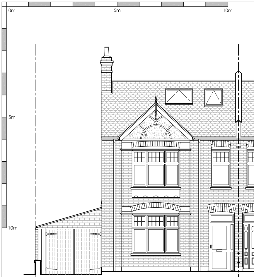
1 - FRONT ELEVATION