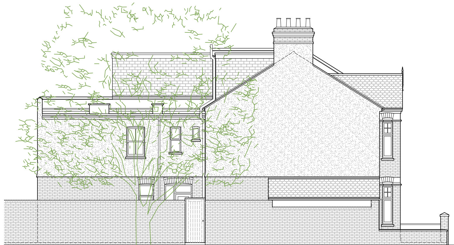
2 - SIDE ELEVATION