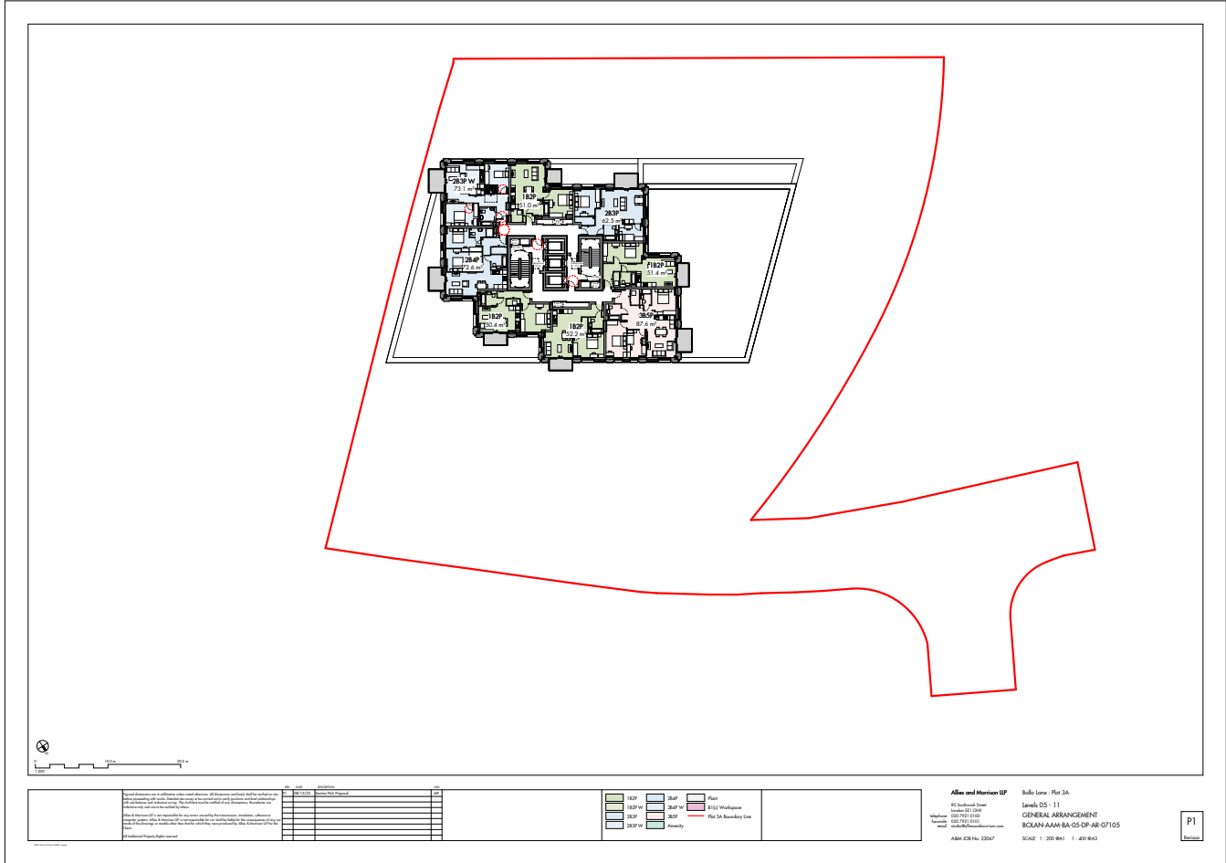
S96A Proposal: Level 5-11 Floor Plan - BOLAN-AAM-BA-22-DP-AR-07105