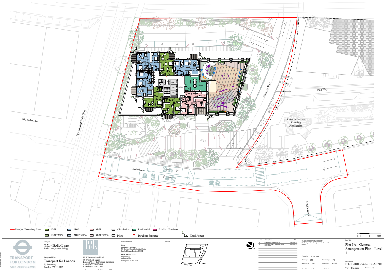
December 2021 Permission: Level 4 Floor Plan.