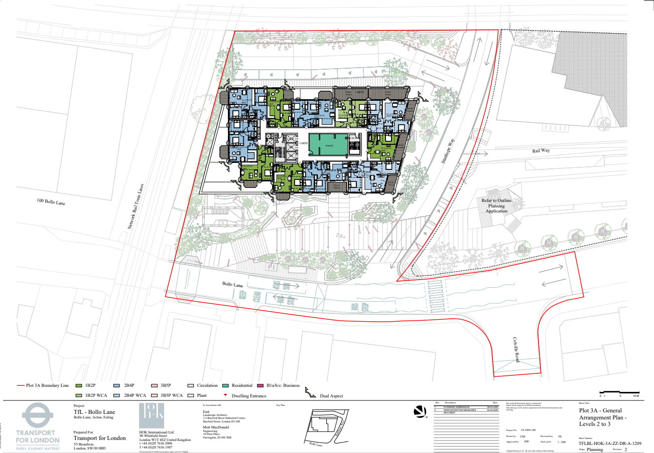
December 2021 Permission: Level 2-3 Floor Plan.