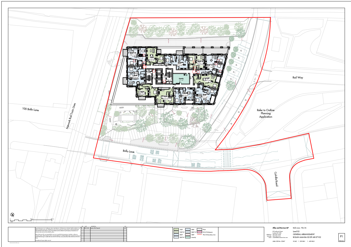
S96A Proposal: Level 2 Floor Plan - BOLAN-AAM-BA-22-DP-AR-07102