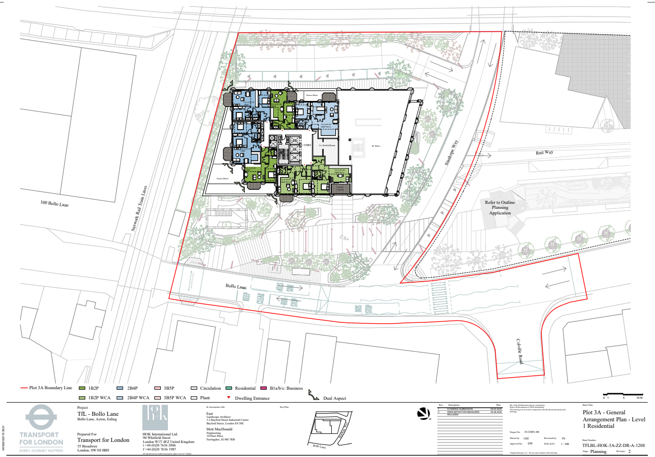
December 2021 Permission: Residential Mezzanine Floor Plan.