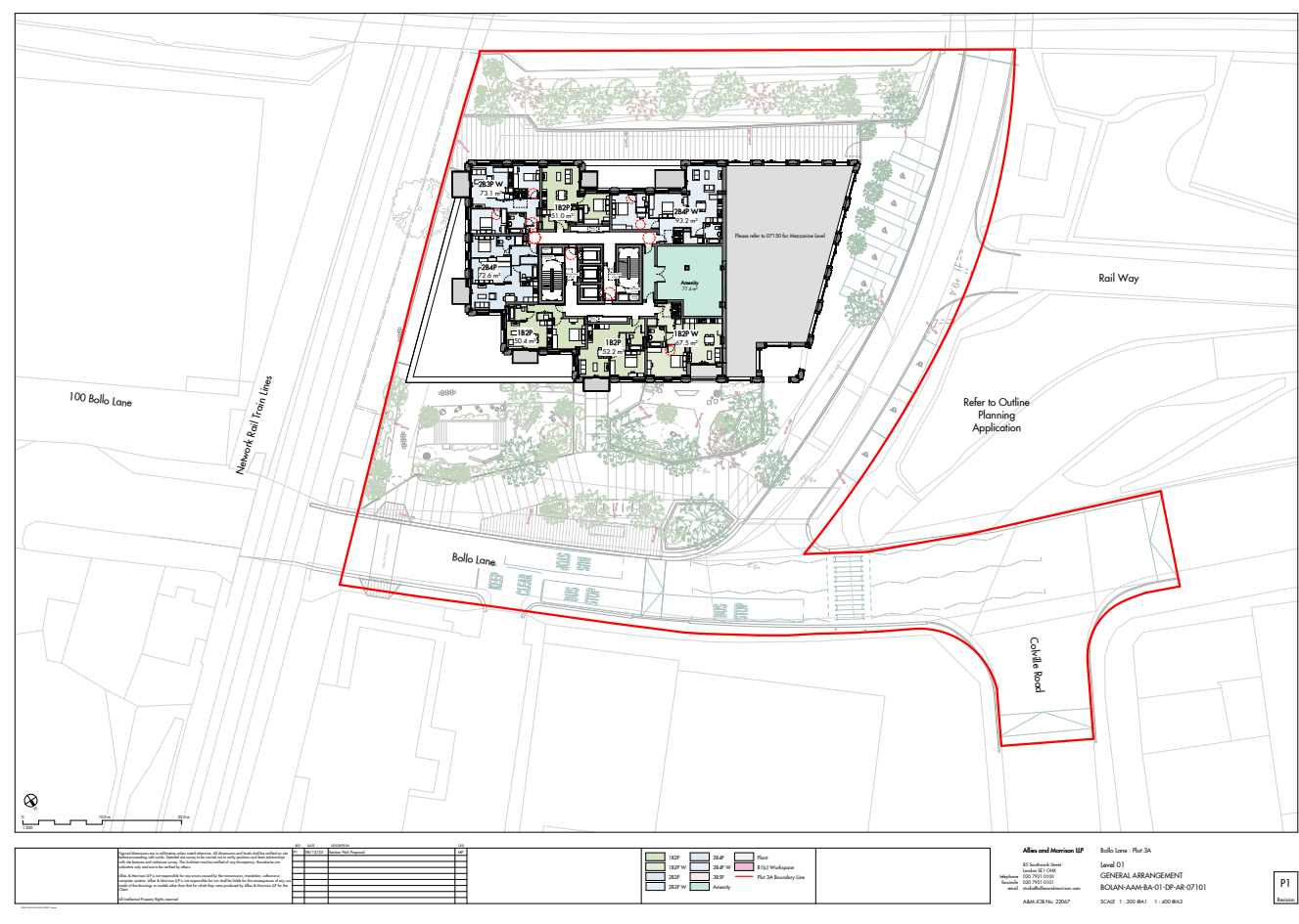
S96A Proposal: Level 1 Floor Plan - BOLAN-AAM-BA-22-DP-AR-07101