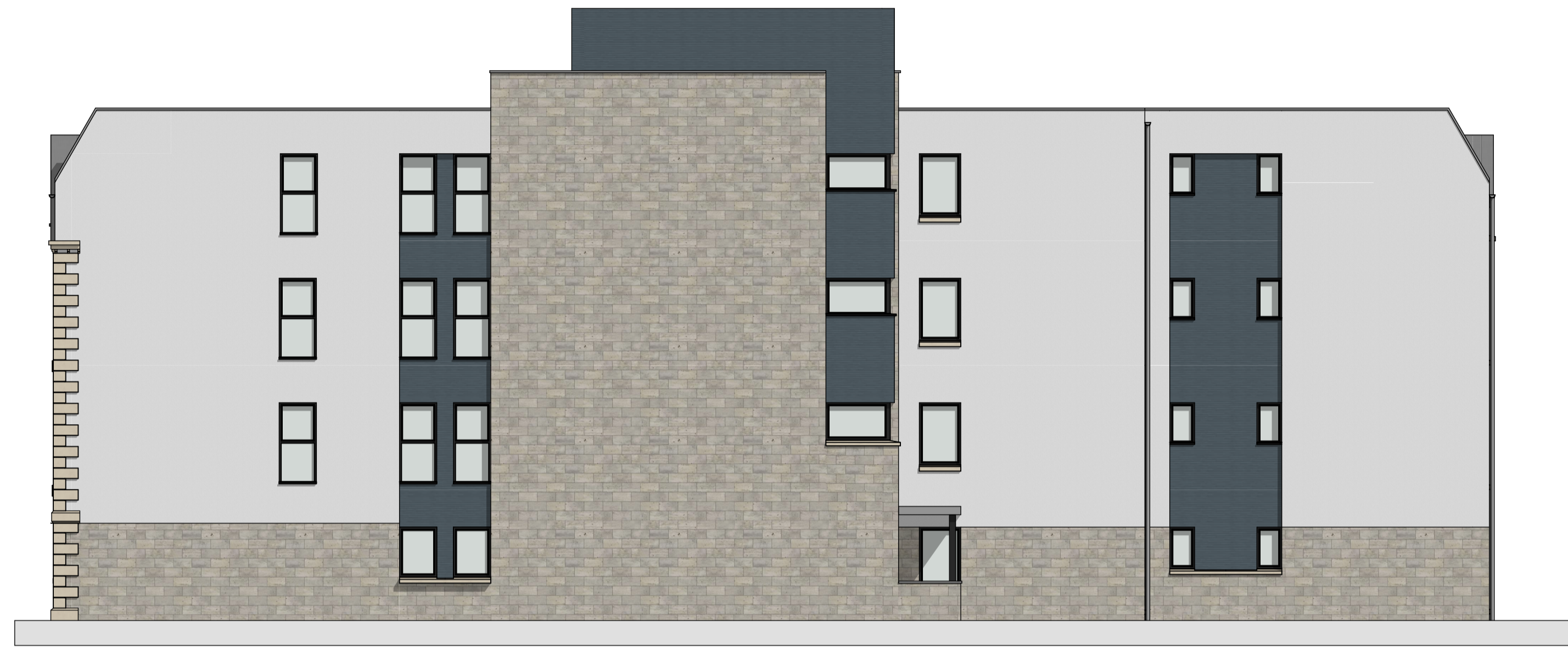
NORTH ELEVATION | 1:100