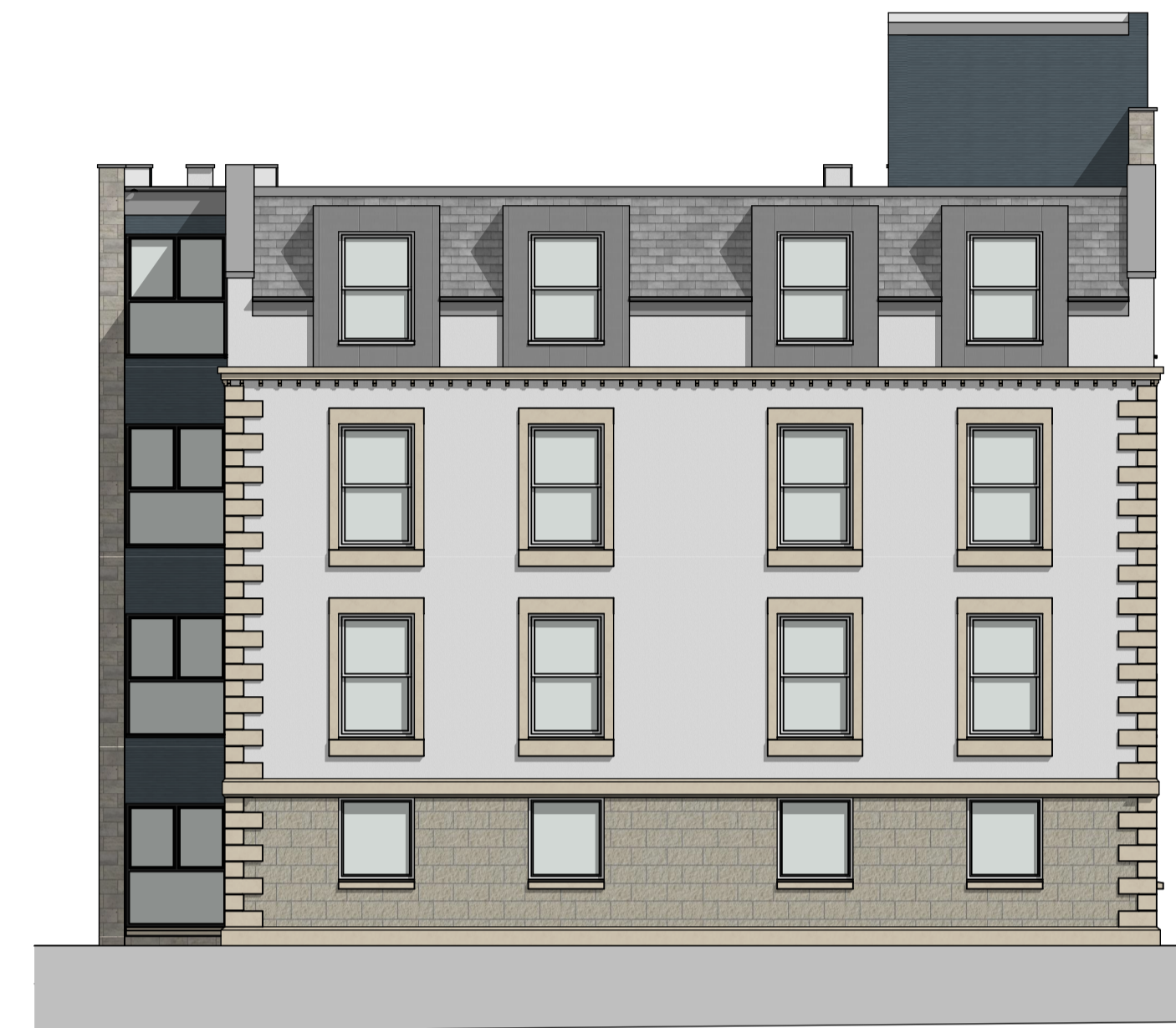
EAST ELEVATION | 1:100