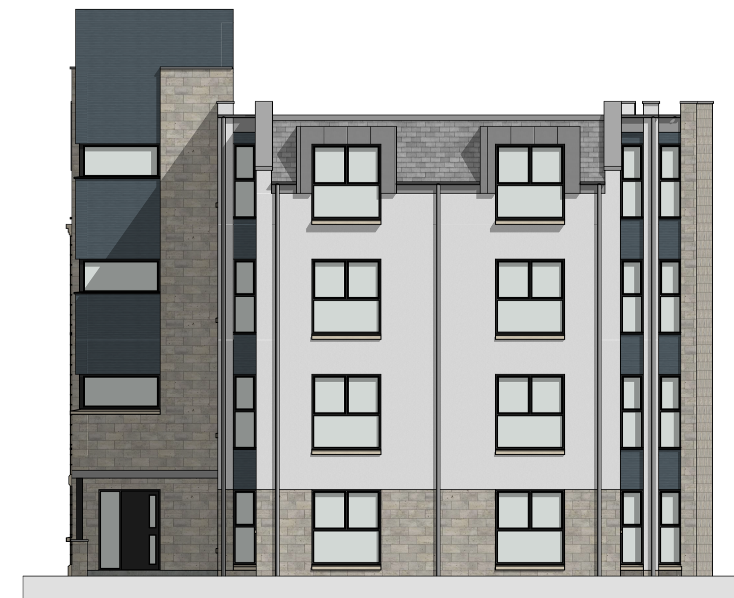
WEST ELEVATION | 1:100