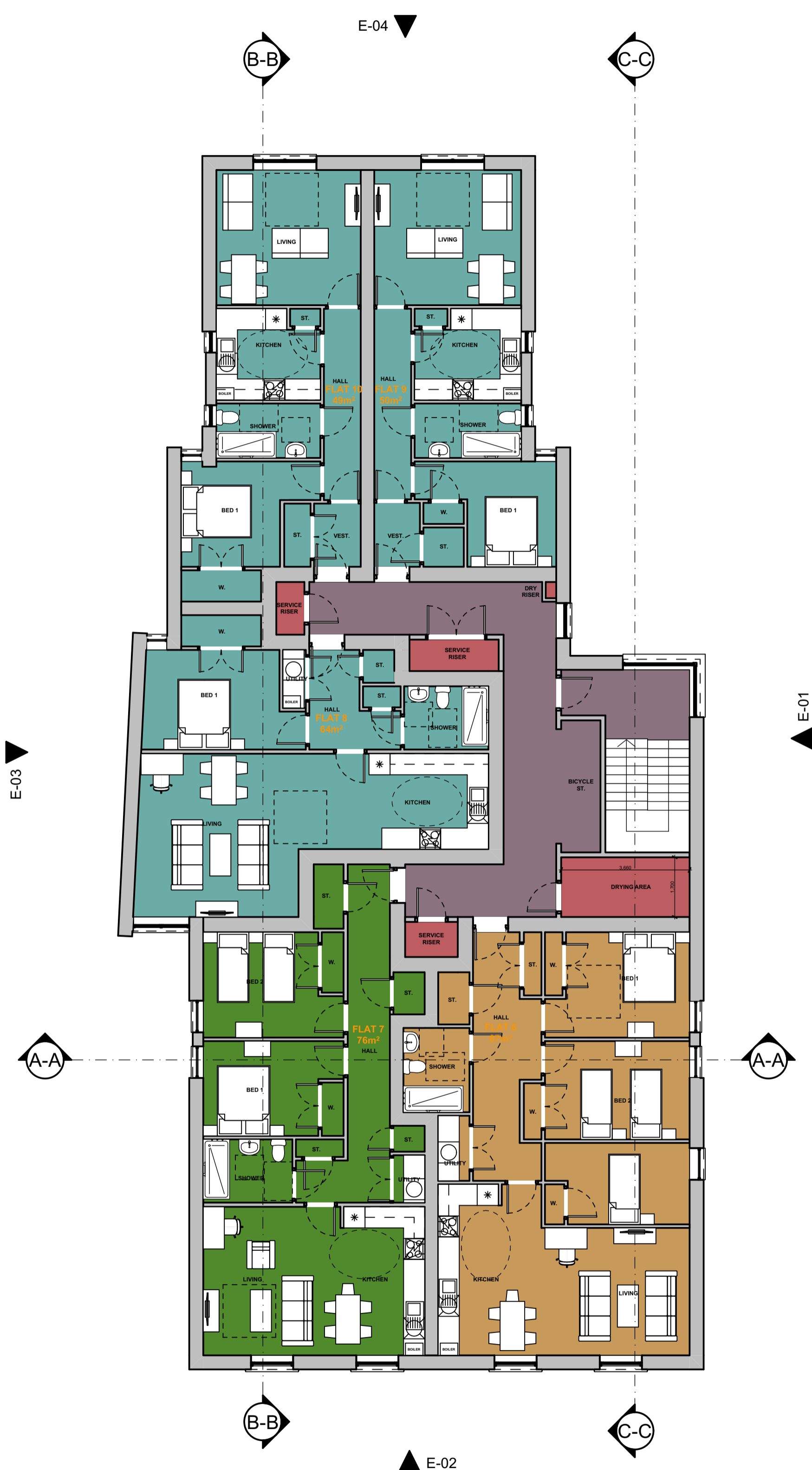
FIRST FLOOR | 1:100