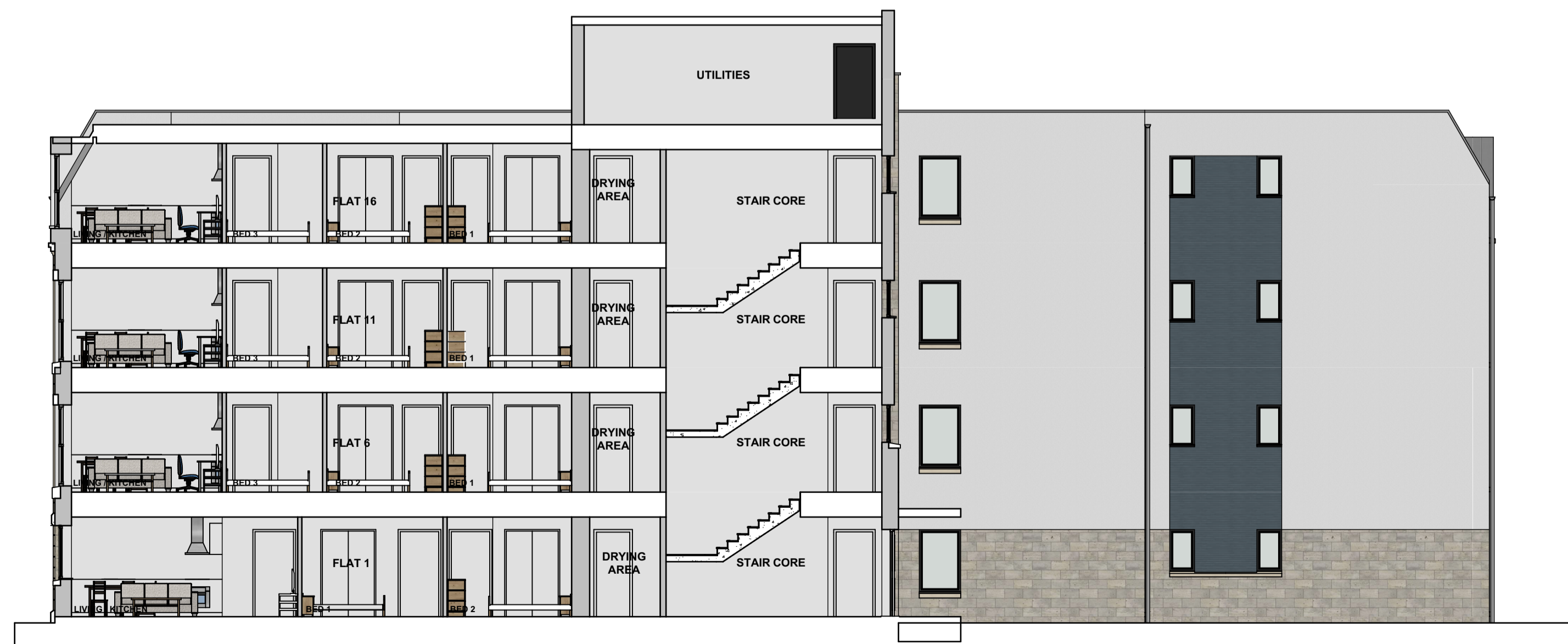
SECTION C-C | 1:100

DRAWING TO BE READ IN CONJUNCTION WITH STRUCTURAL ENGINEER'S DETAILS AND SPECIFICATION. ENGINEER'S DETAILS TO TAKE PRECEDENCE. CONTRACTOR TO VERIFY ALL DIMENSIONS ON SITE. ALL DIMENSIONS IN MILLIMETRES UNLESS STATED OTHERWISE. CONTRACTOR NOT TO SCALE DIMENSIONS FROM DRAWINGS. REFER TO ARCHITECT FOR DIMENSIONS IF NOT INDICATED ON THE DRAWING. ANY DISCREPANCIES, ERRORS OR OMISSIONS ON THIS DOCUMENT TO BE IMMEDIATELY REPORTED TO THE ARCHITECT.