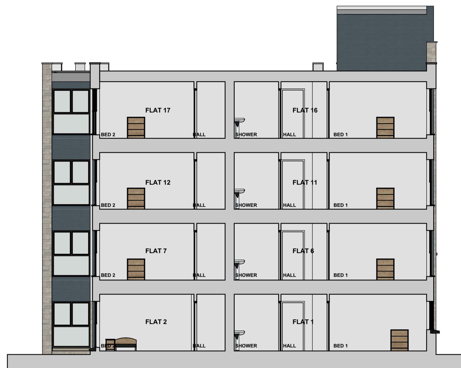
SECTION A-A | 1:100