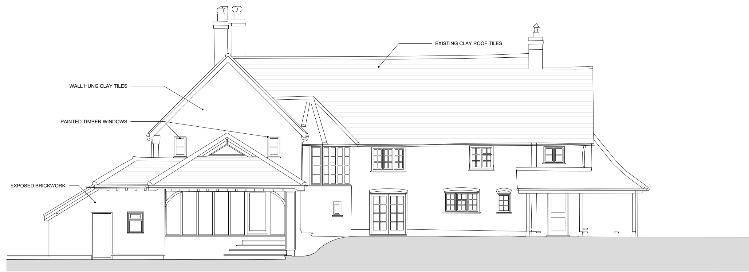
01 | EXISTING ELEVATION - SOUTH