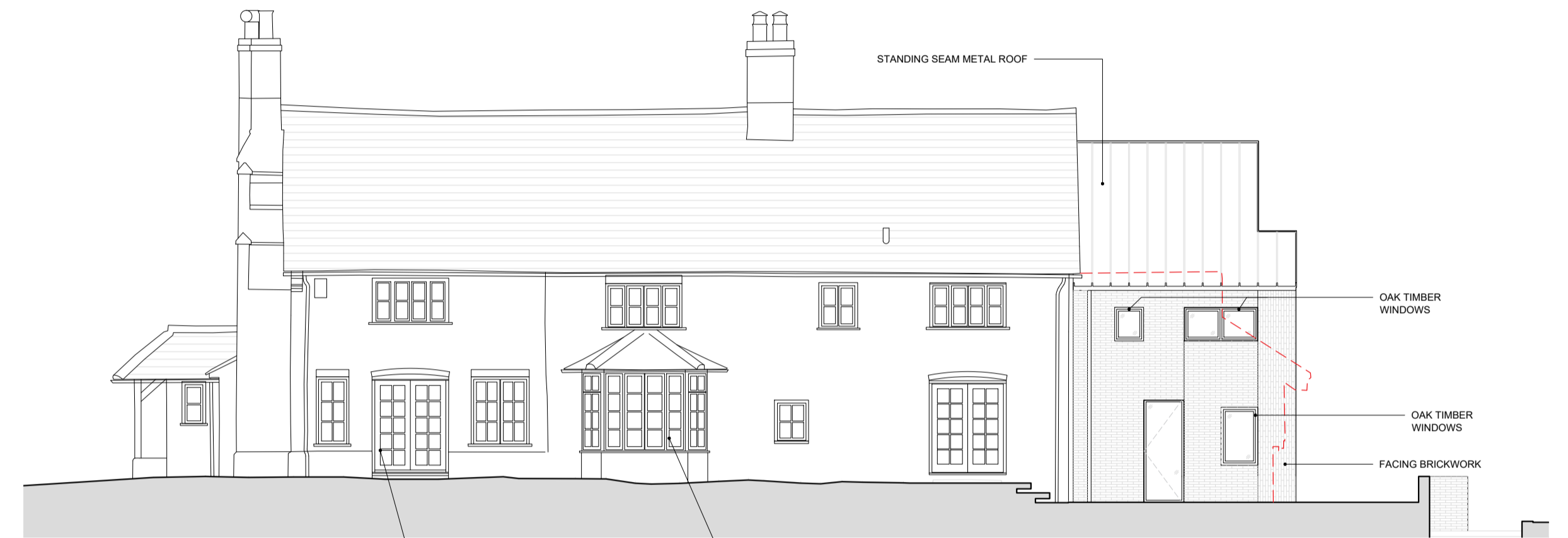
04 | PROPOSED ELEVATION - WEST