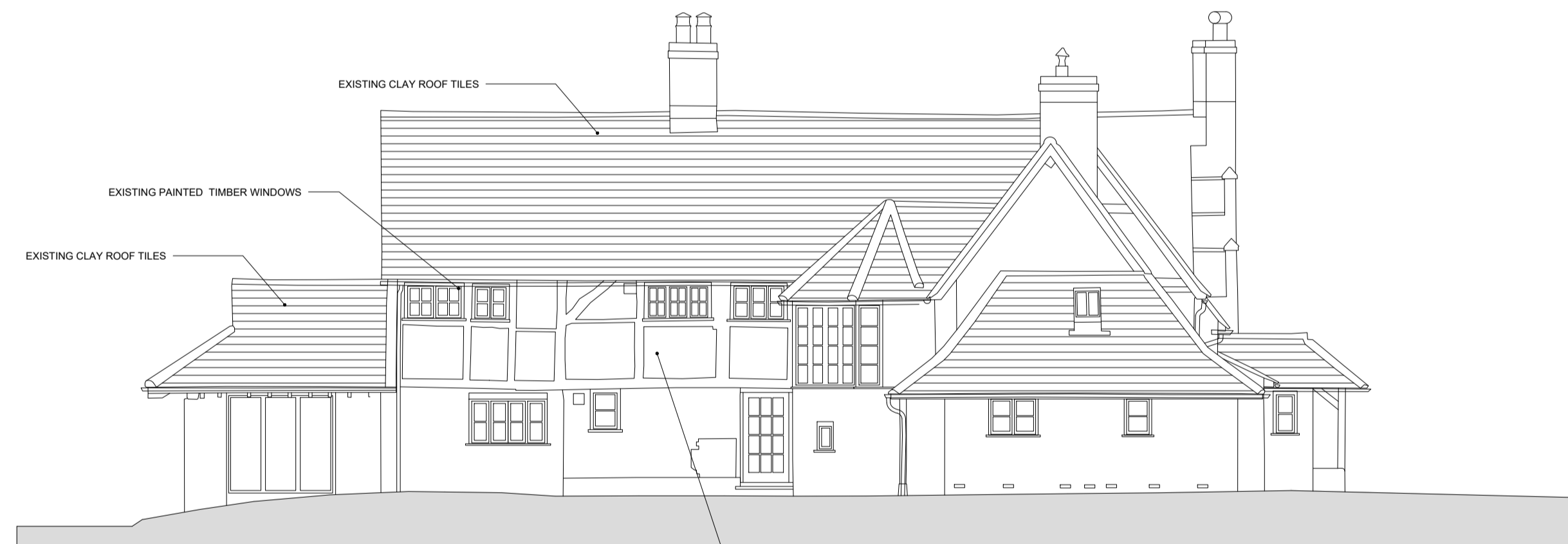
05 | EXISTING ELEVATION - EAST