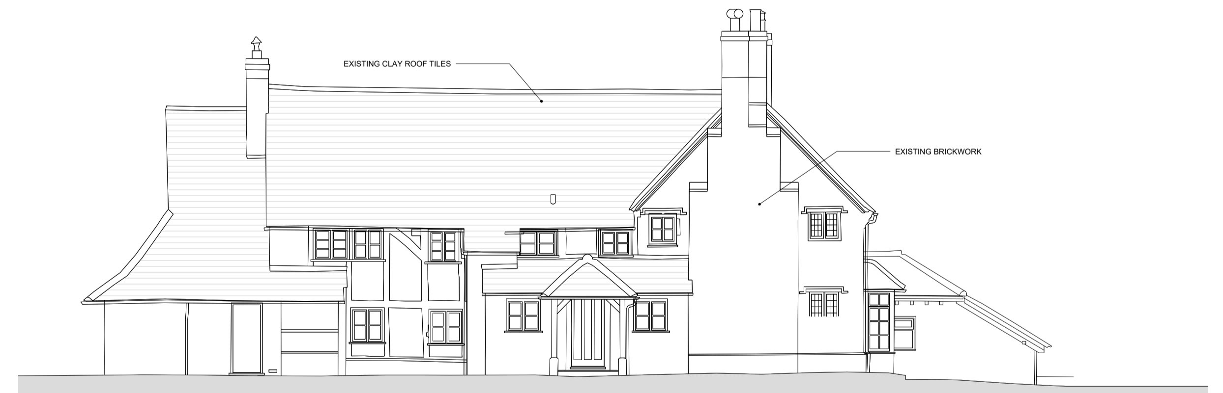
07 | EXISTING ELEVATION - NORTH