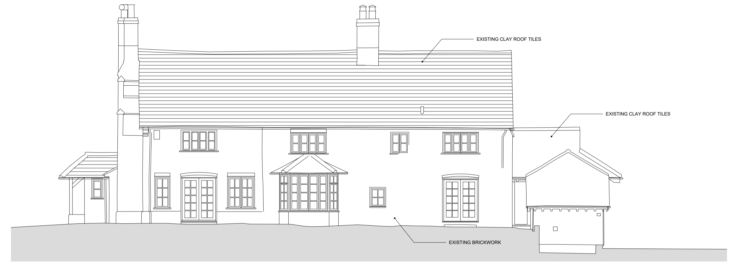
03 | EXISTING ELEVATION - WEST