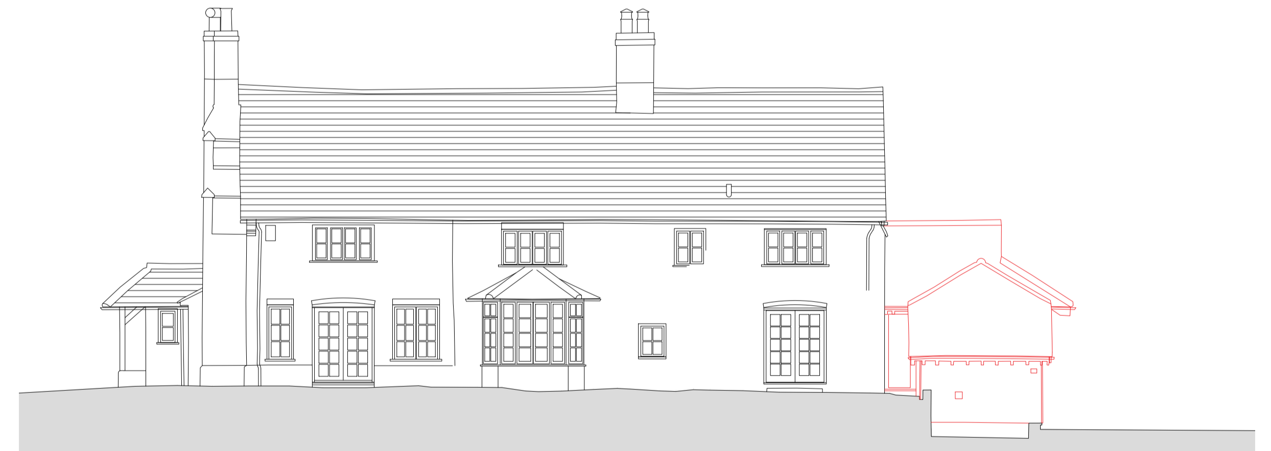
03 | EXISTING ELEVATION - WEST