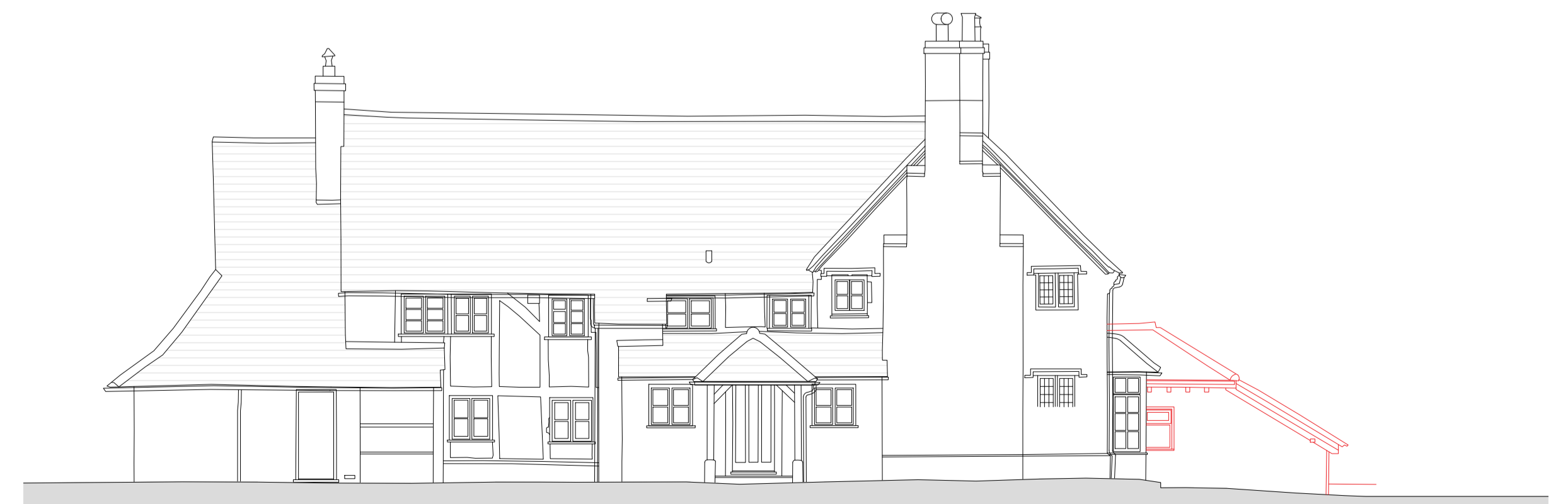
07 | EXISTING ELEVATION - NORTH