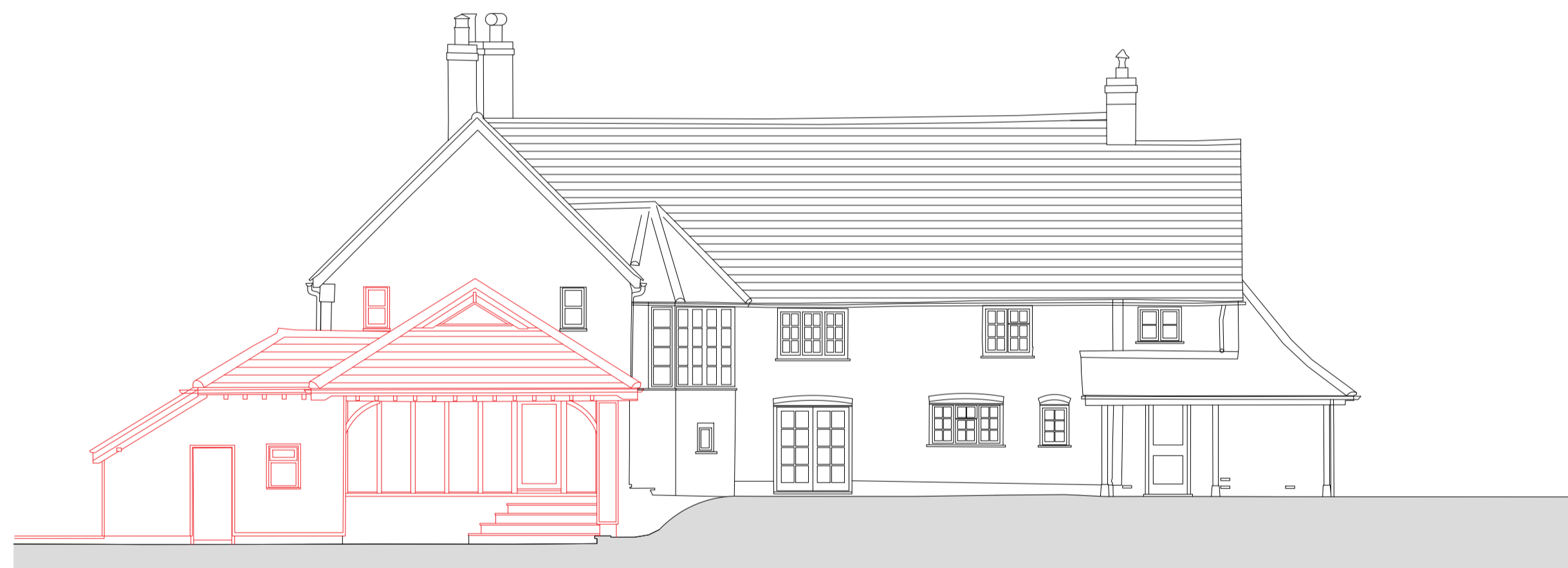
01 | EXISTING ELEVATION - SOUTH