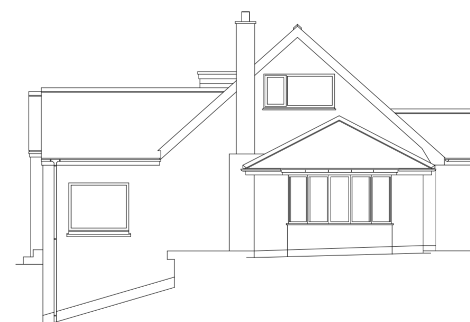
EXISTING SOUTH EAST ELEVATION