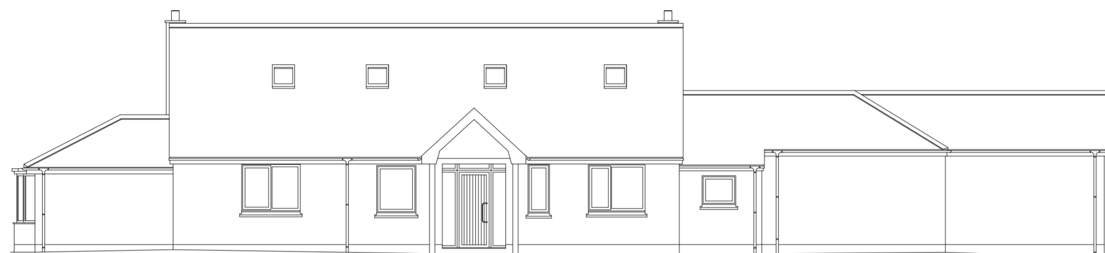
EXISTING NORTH EAST ELEVATION