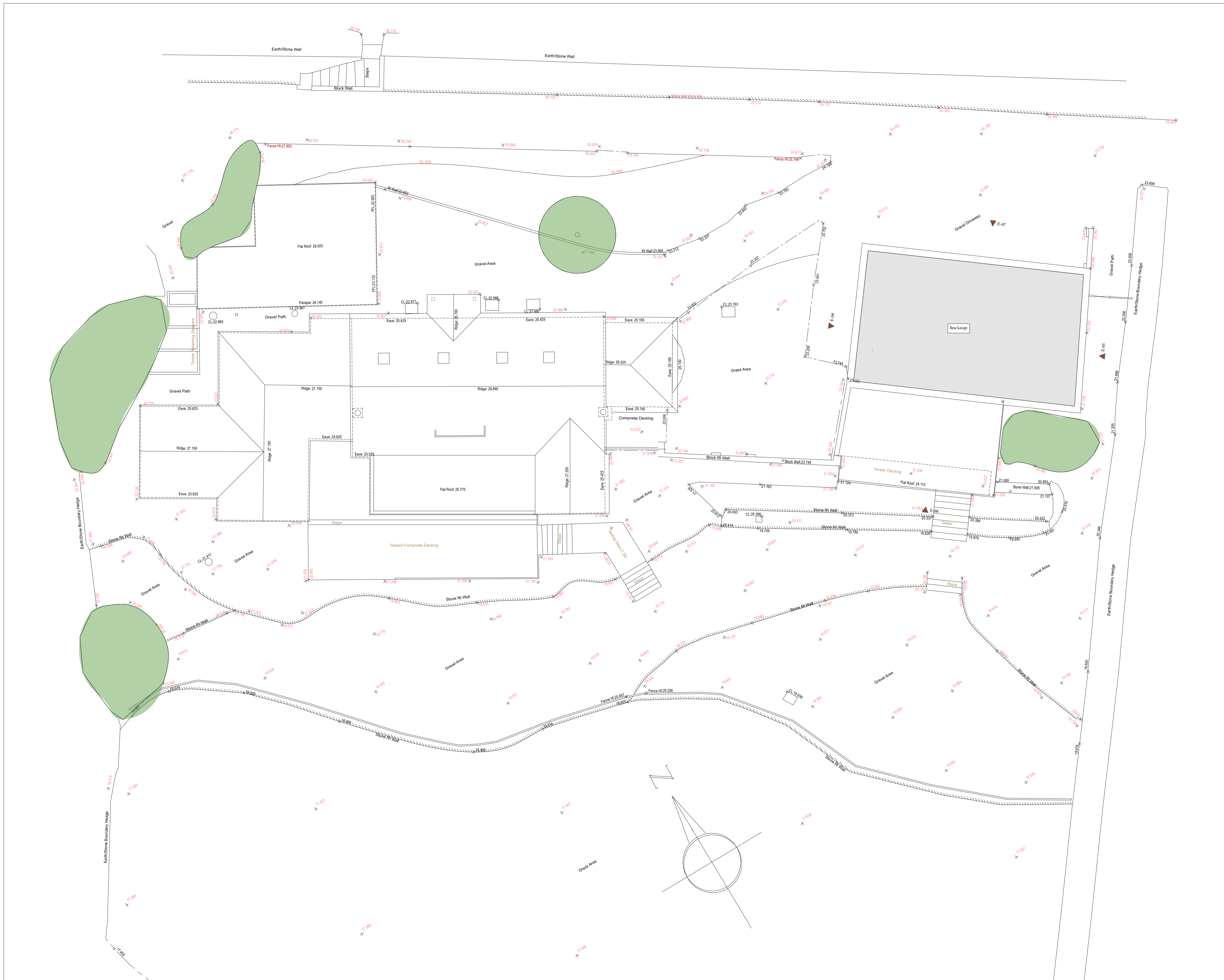
Proposed Site Layout 1:100