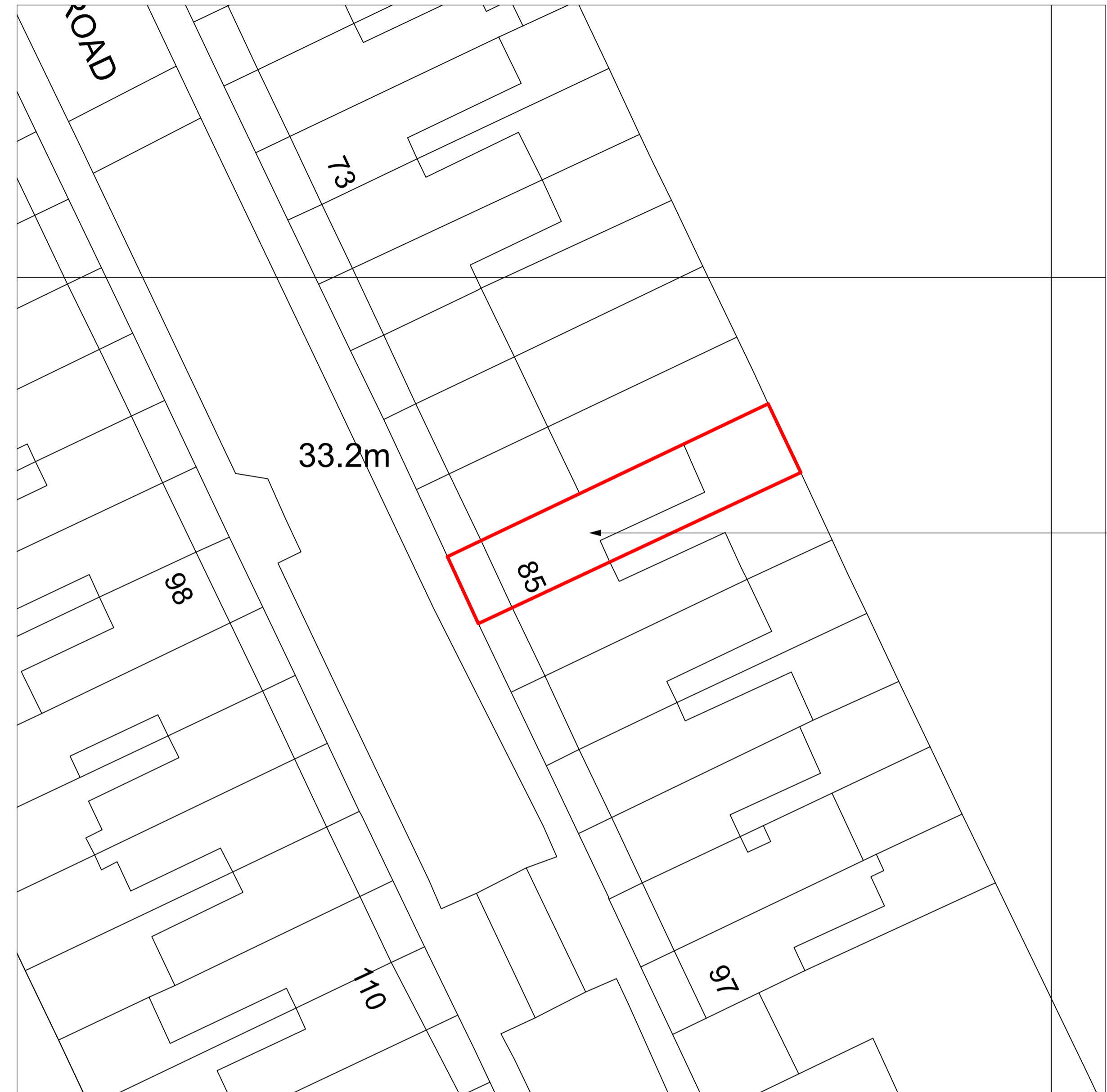
BLOCK PLAN SCALE 1:500 @ A3