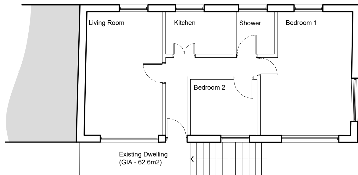
Existing First Floor Plan 1:100