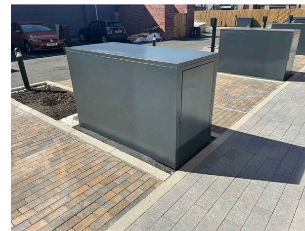
Example of Proposed Cycle Storage Locker