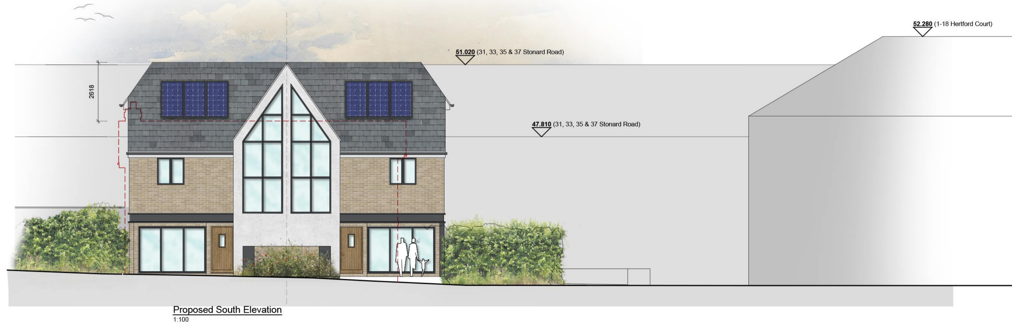
Proposed South Elevation 1:100

Proposed Residential Development 19 Hertford Court, Enfield, N13 4DD Existing and Proposed South Elevation