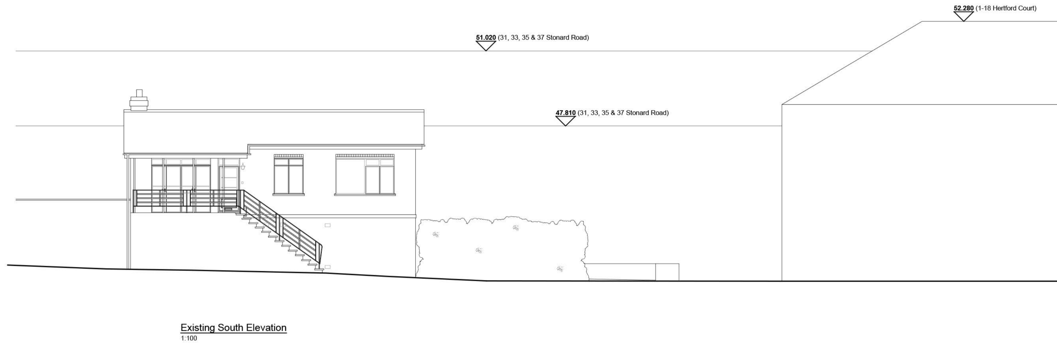
Existing South Elevation 1:100