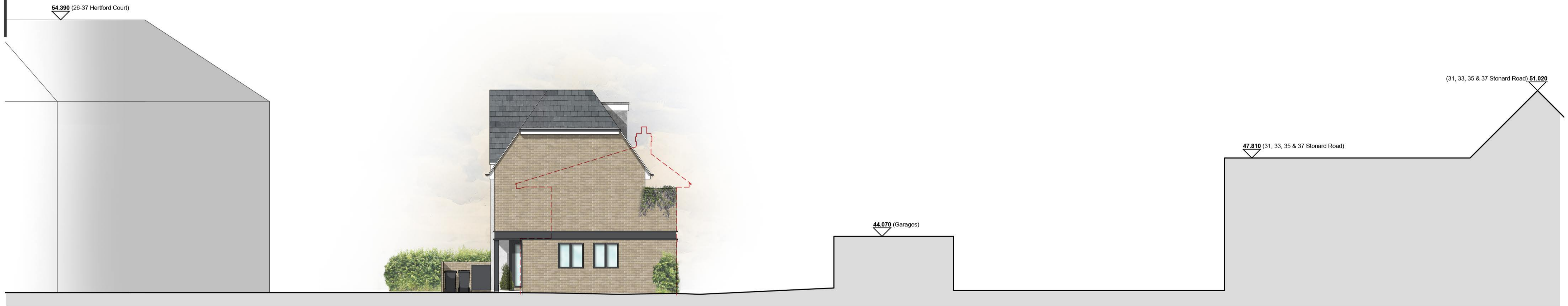
Proposed East Elevation 1:100

Proposed Residential Development 19 Hertford Court, Enfield, N13 4DD Existing and Proposed East Elevation