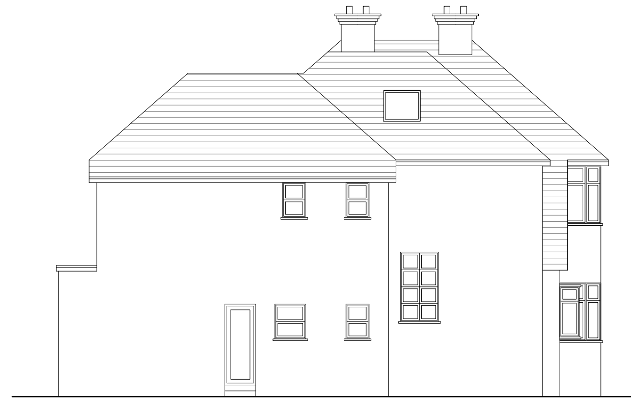
Proposed Side Elevation Scale 1:100