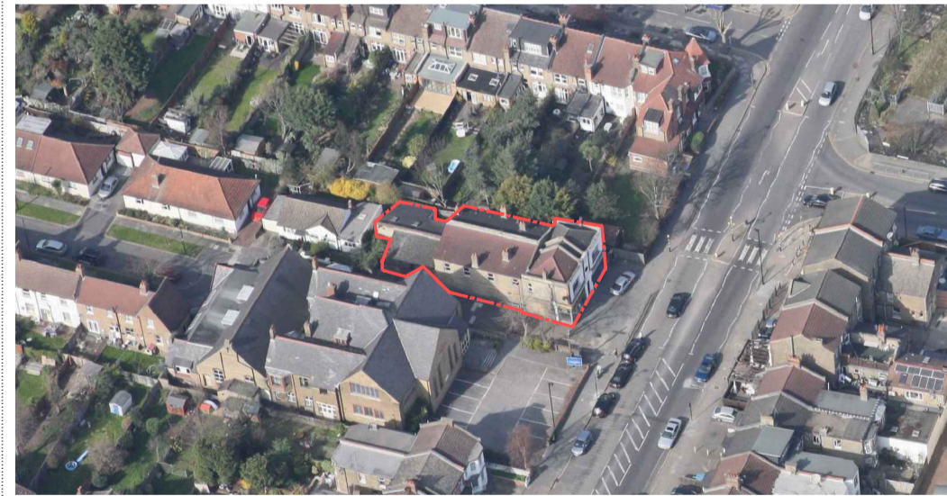
3. Aerial view from south