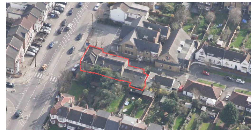
2. Aerial view from north