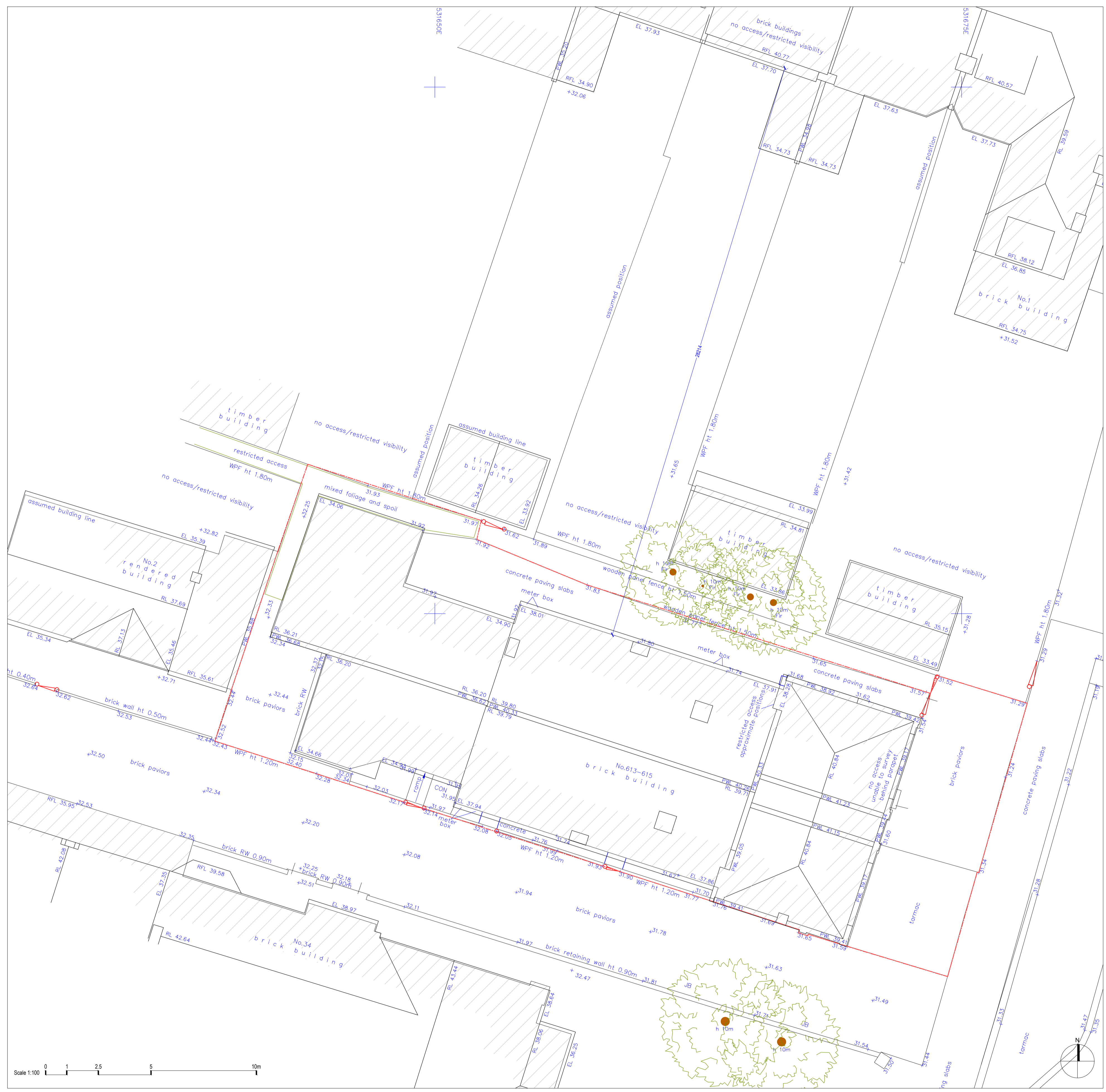
[05] EXISTING TOPOGRAPHICAL SURVEY