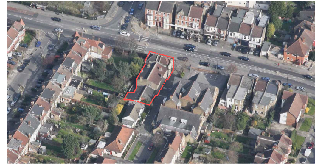
4. Aerial view from west