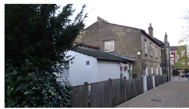
2. View from Lytton Avenue