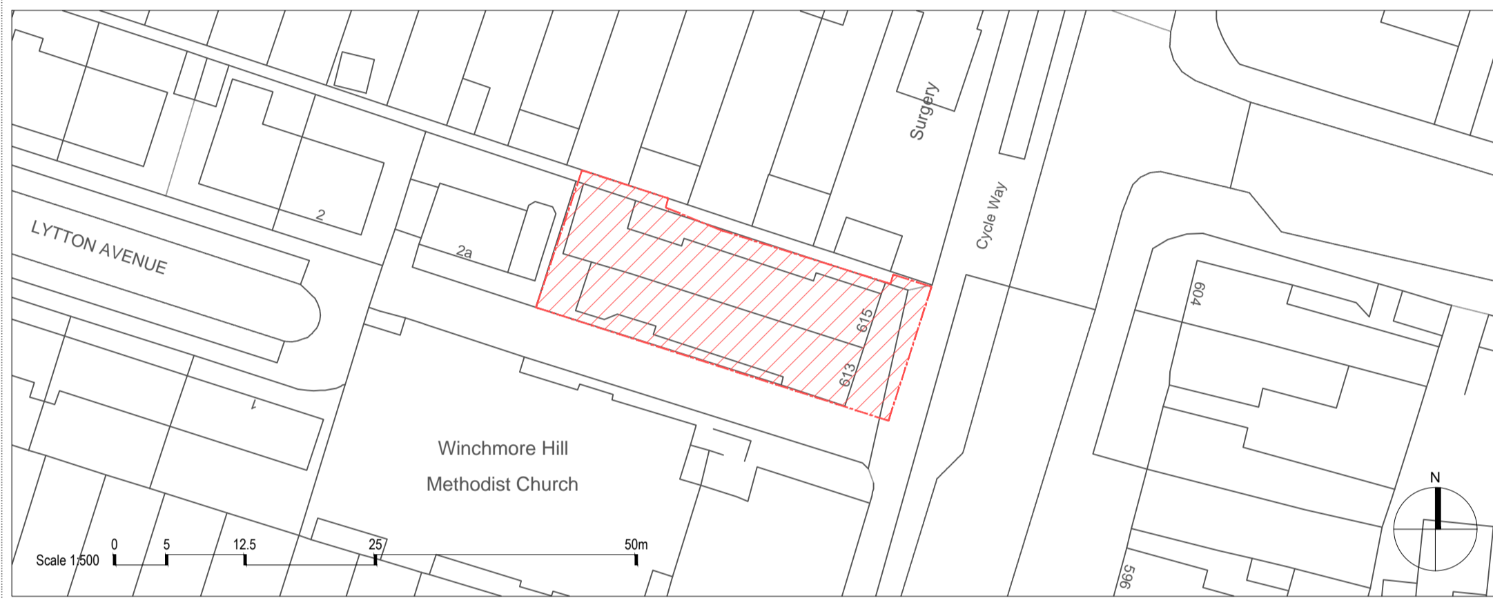
[02] EXISTING BLOCK PLAN