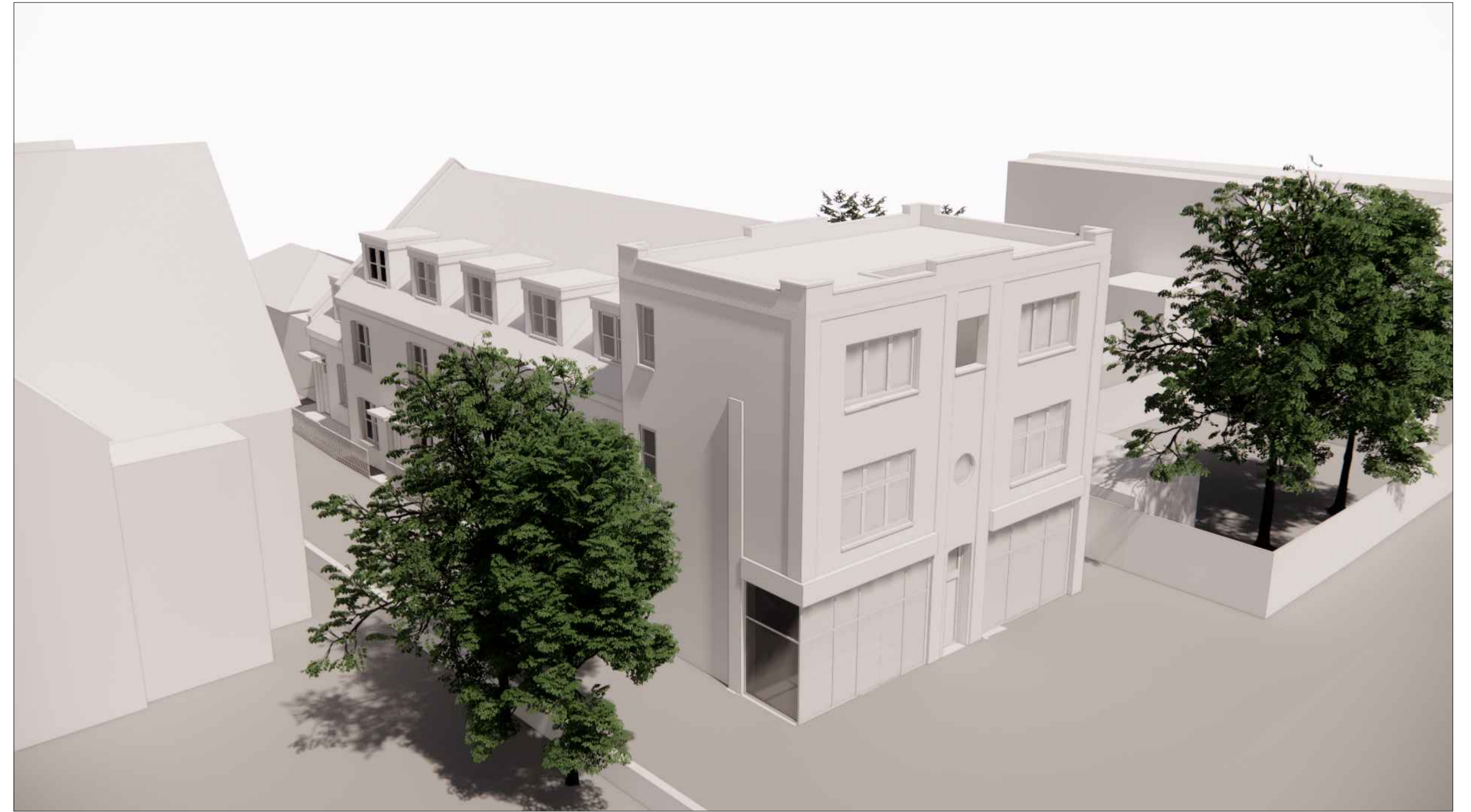
[02] PROPOSED BUILDING VISUAL 3