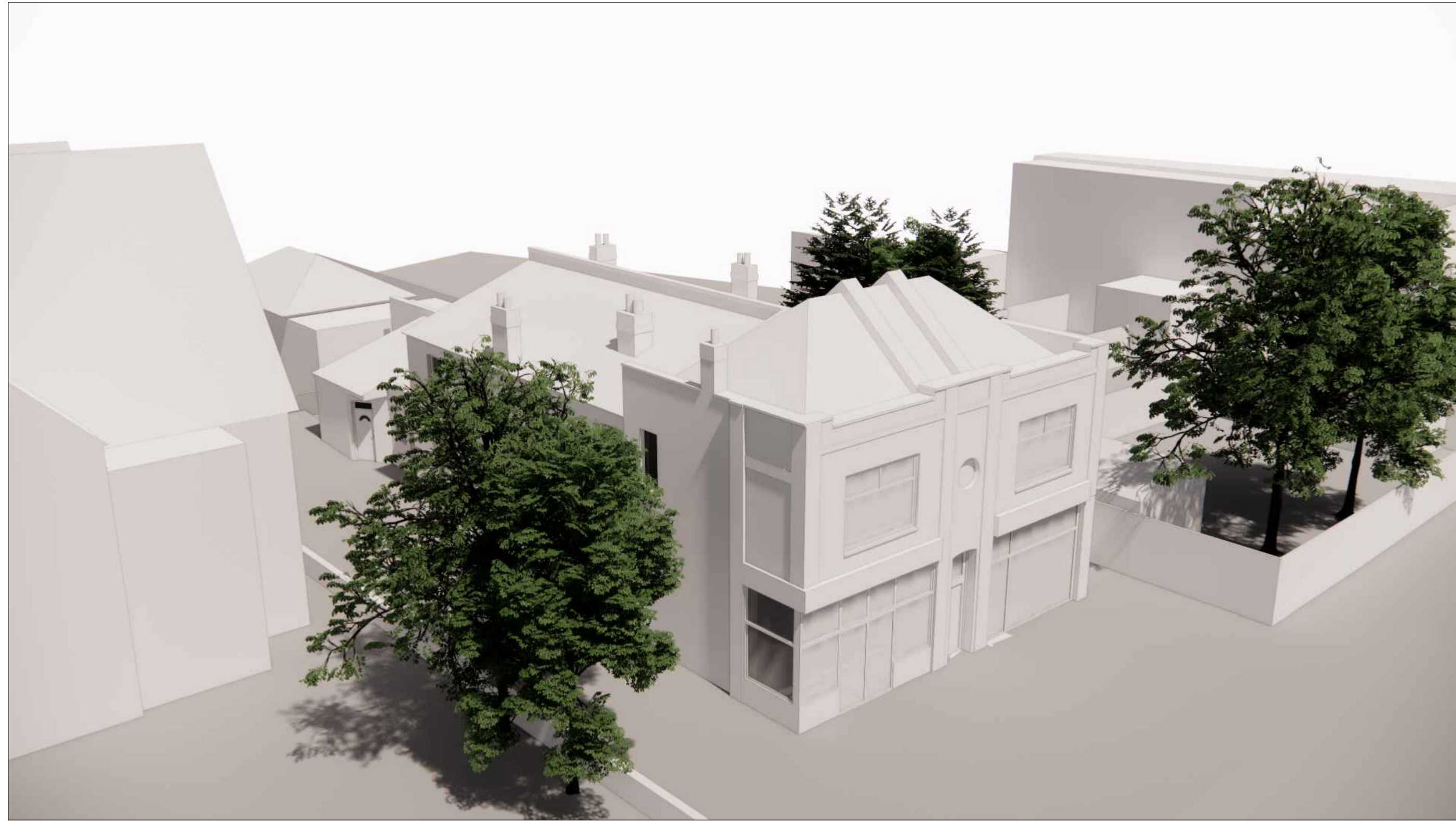
[01] EXISTING BUILDING VISUAL 3