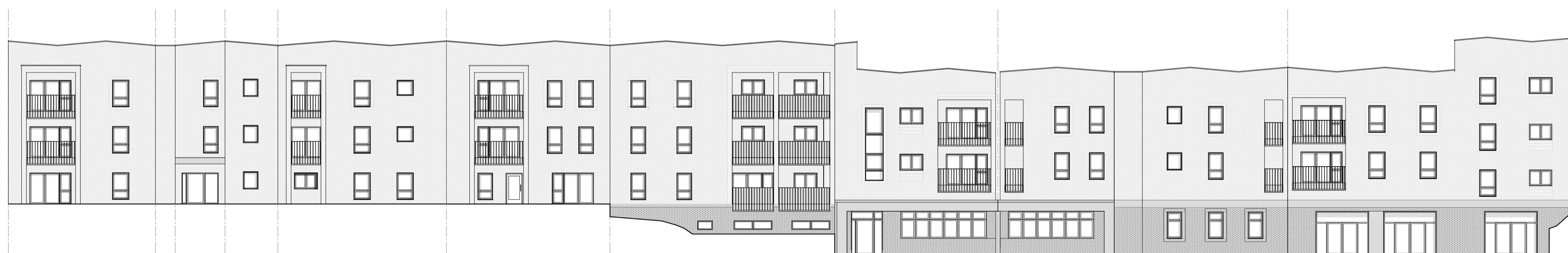
1 | West Pavilion 1:200