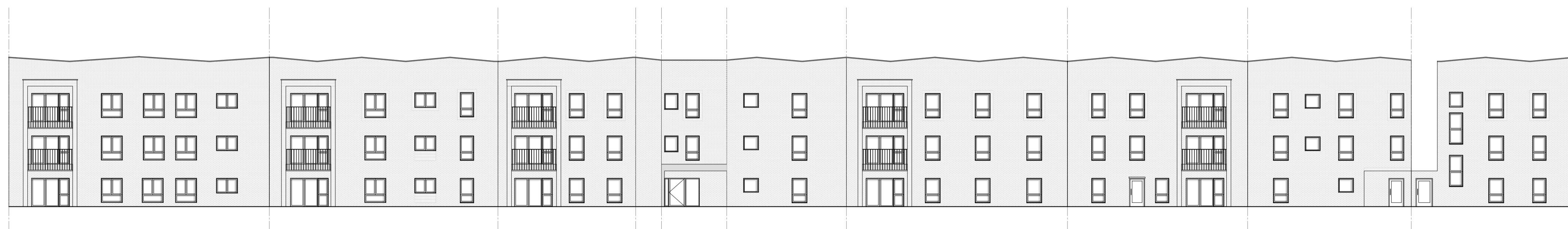
2 | East Pavilion 1:200