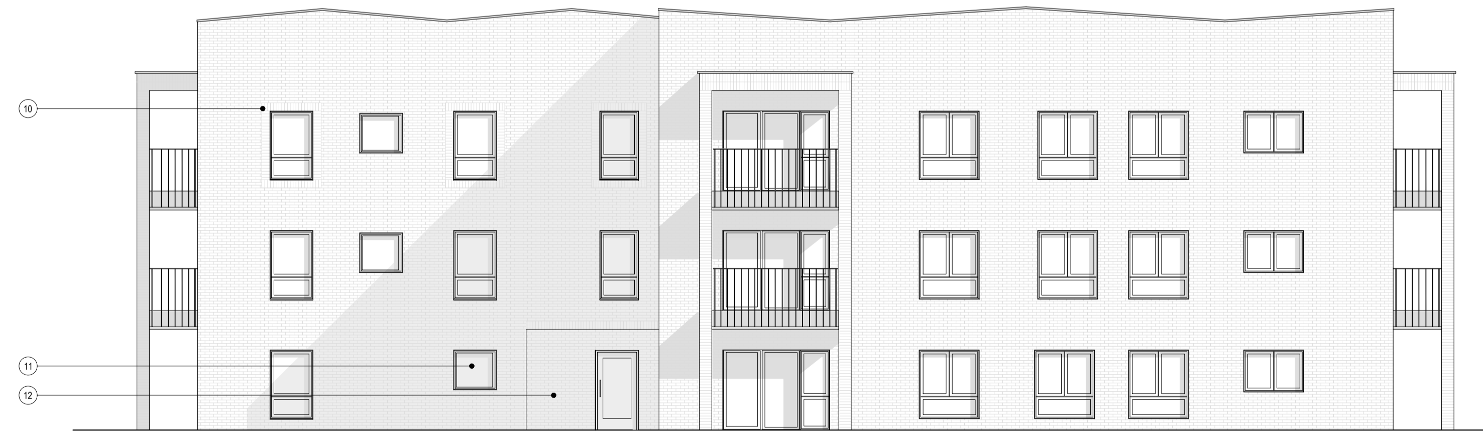
Elevation 4 | East Elevation 1:100