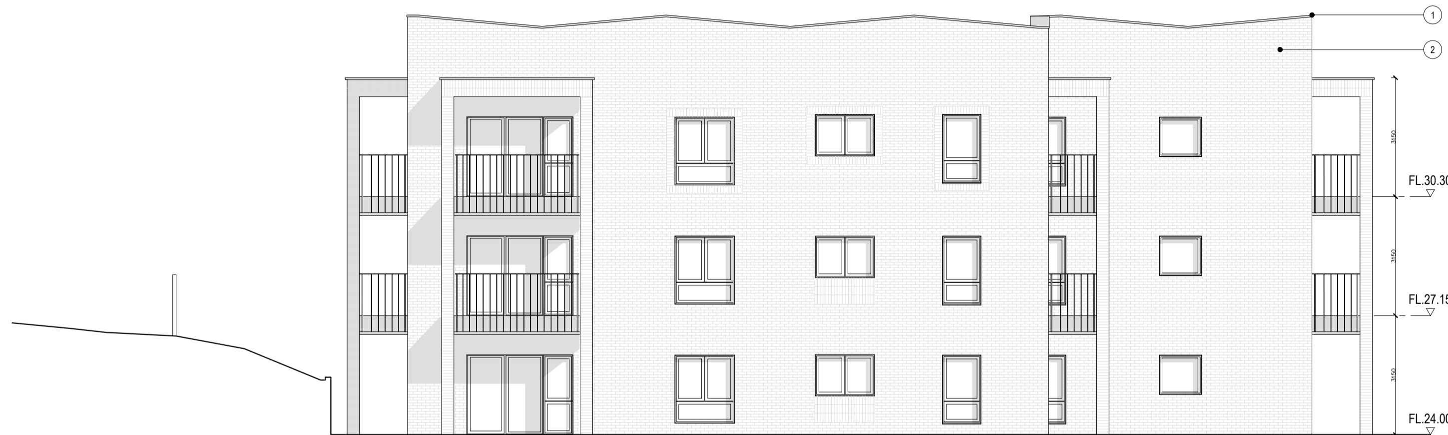
Elevation 1 | North Elevation 1:100