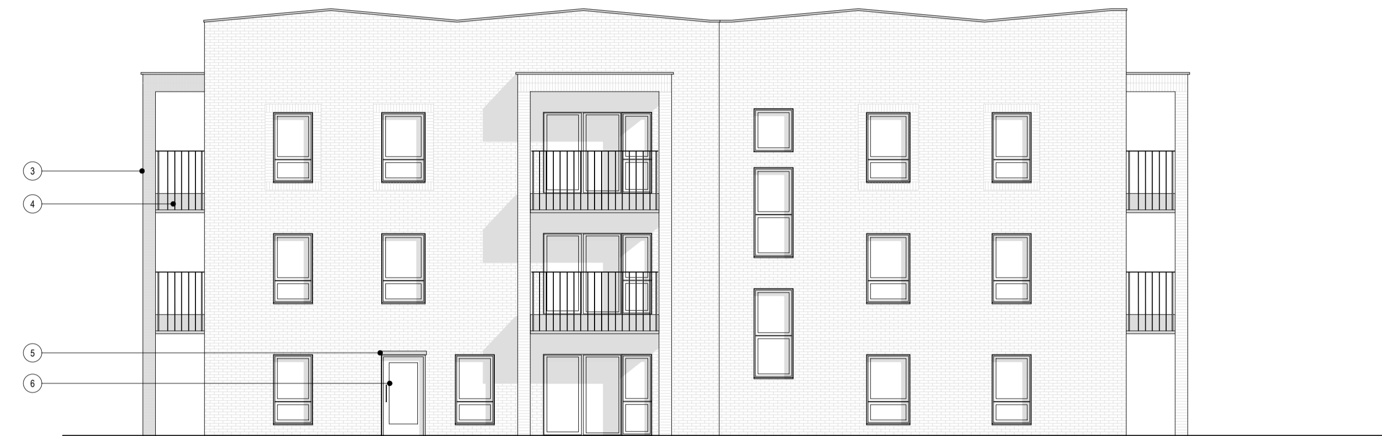
Elevation 3 | South Elevation 1:100