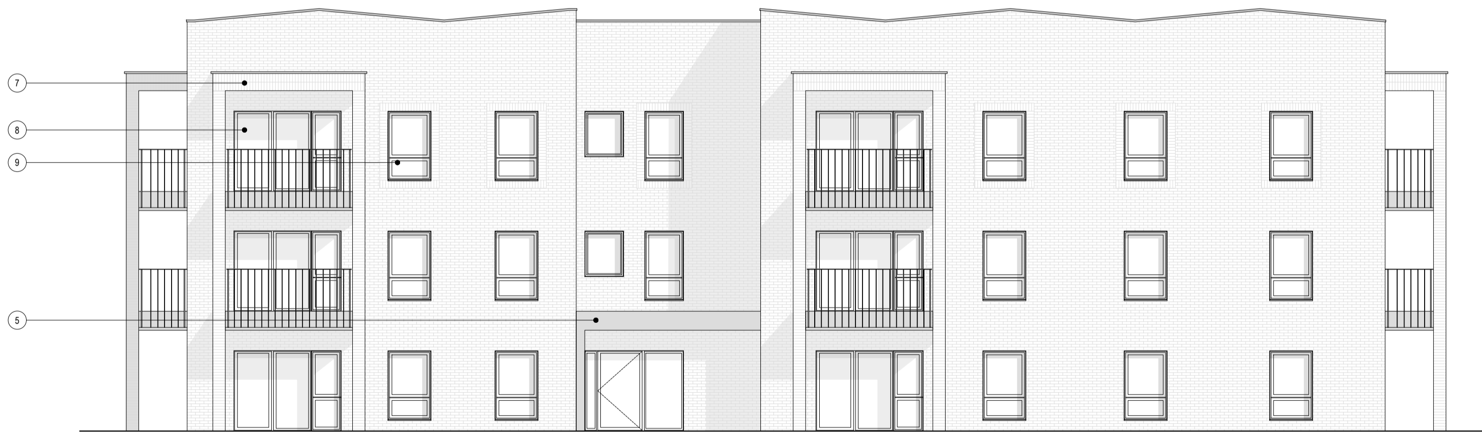
Elevation 2 | West Elevation 1:100