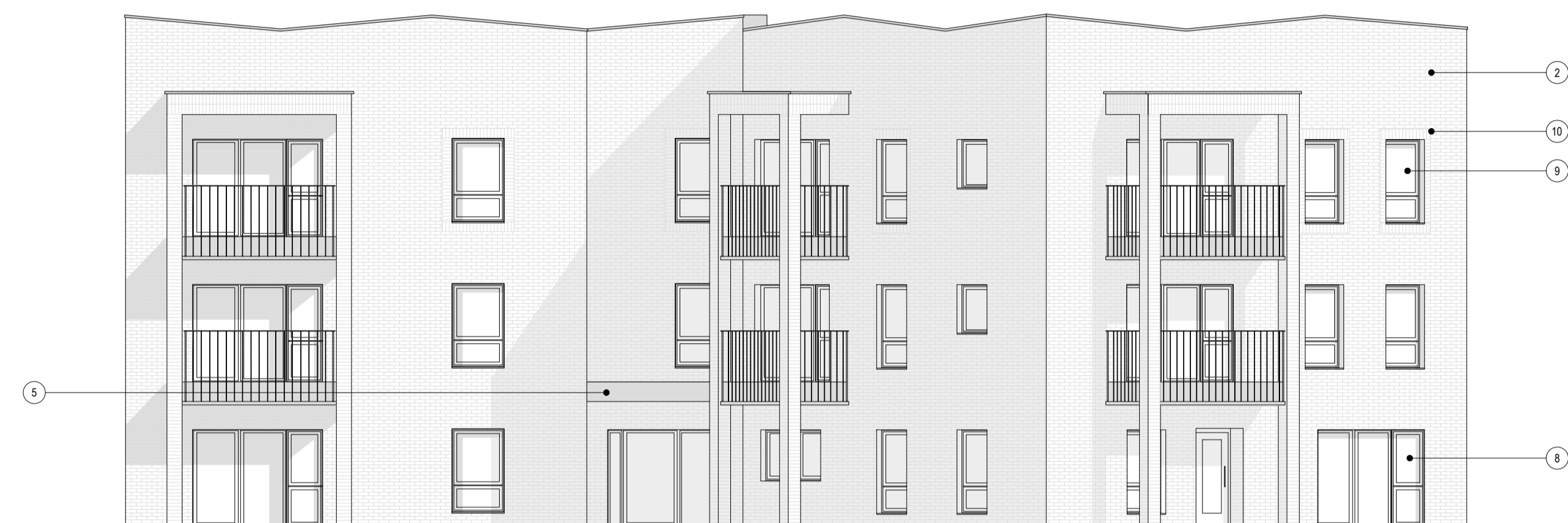
Elevation 4 | East Elevation 1:100