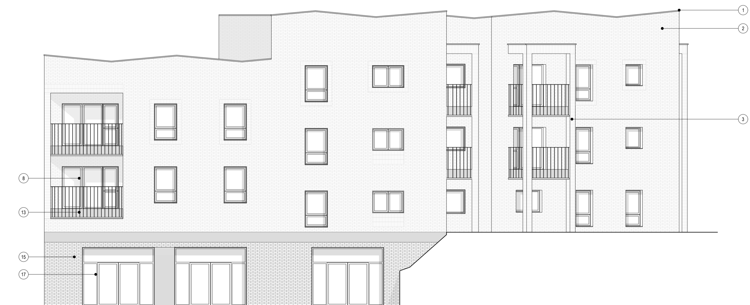
Elevation 3 | South Elevation 1:100