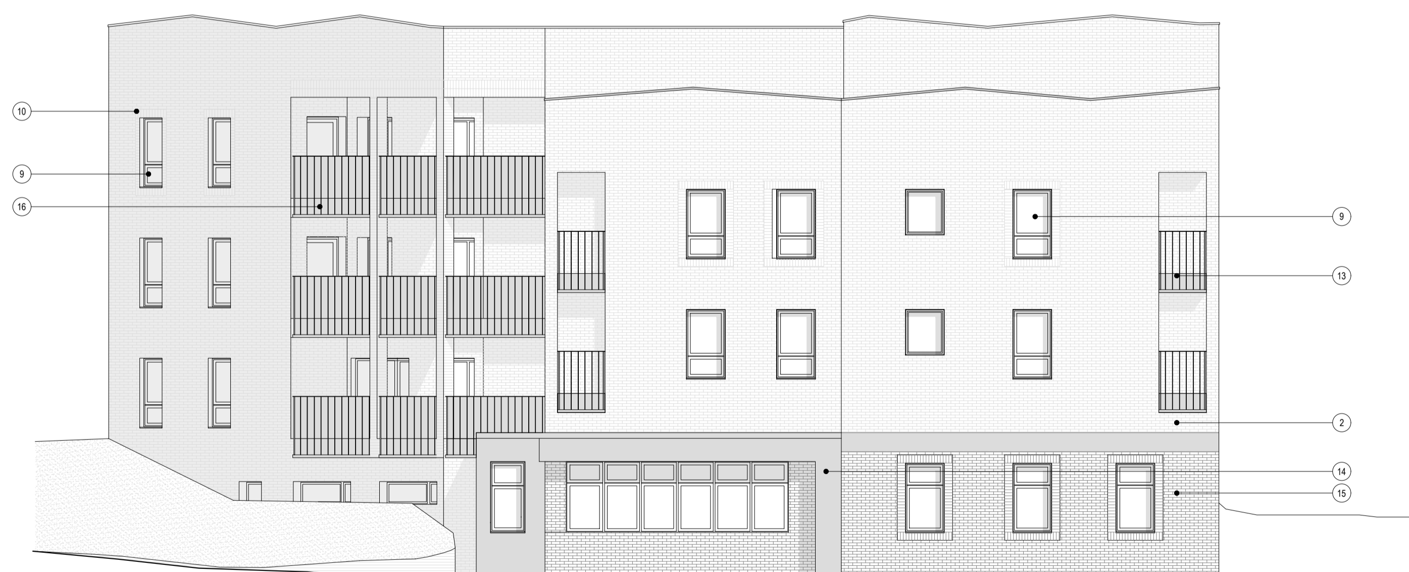
Elevation 2 | West Elevation 1:100