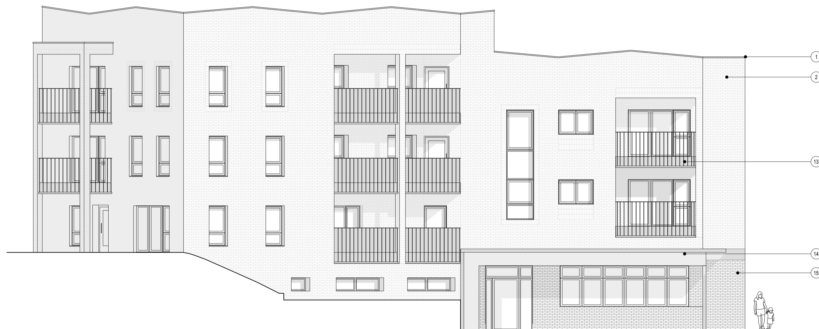
Elevation 1 | North Elevation 1:100