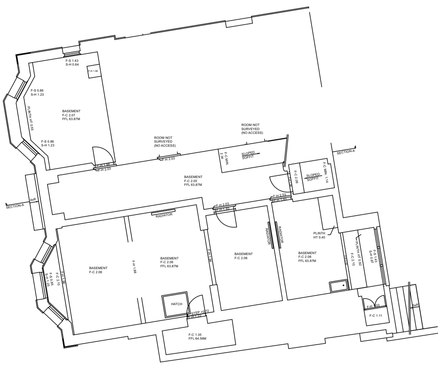
ASHLEY LODGE BASEMENT