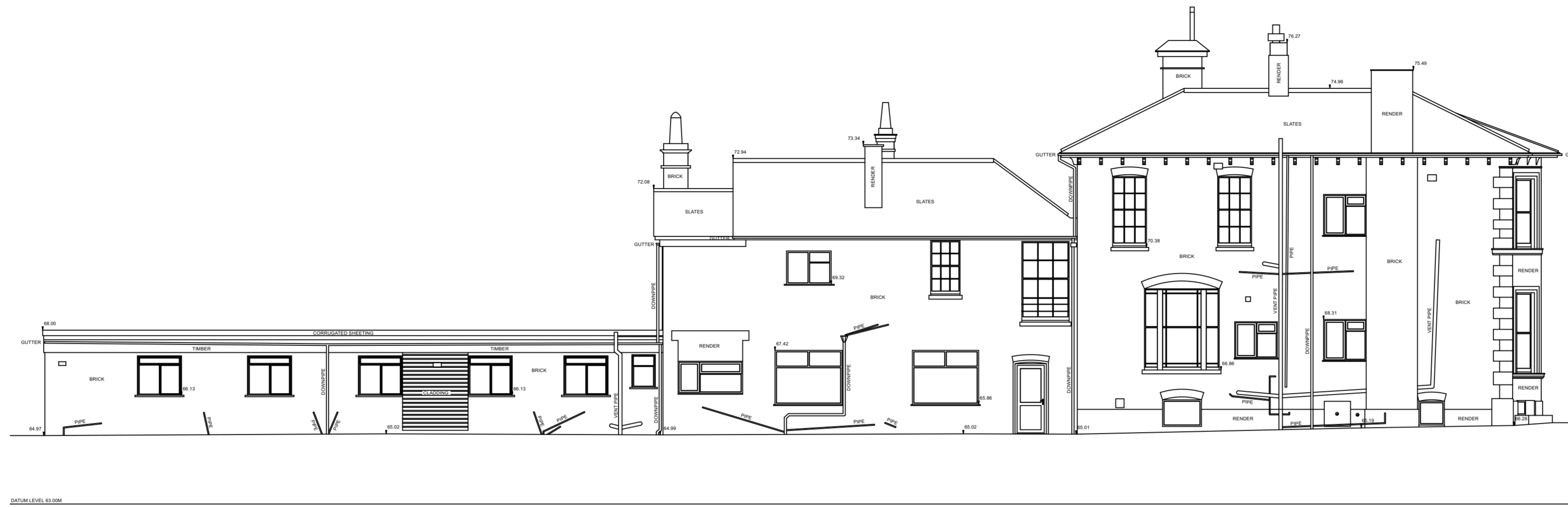
ASHLEY LODGE NORTH ELEVATION (SIDE)

Note This drawing is to be read in conjunction with all other consultants engineers and specialist sub-contractors drawings. All items are to be cross referenced throughout design, tender & construction. Any discrepancies whatsoever discovered must be reported to the Main Contractor or Contract Administrator (CA) as soon as they become apparent. The Main Contractor is responsible for checking all dimensions prior to commencement of work. All specified manufacturers are CCA for similar approved CCA or equal approved under the control of not. Any equivalent product or manufacturer must be approved in writing by the CA before use. All structure shown on these drawings is based on structural plans/sections & is to be fully designed, detailed & dimensioned by Other. Refer to Structural Engineers plans for correct structural design. All drawings are to be read in conjunction with project specific NBS national building specification