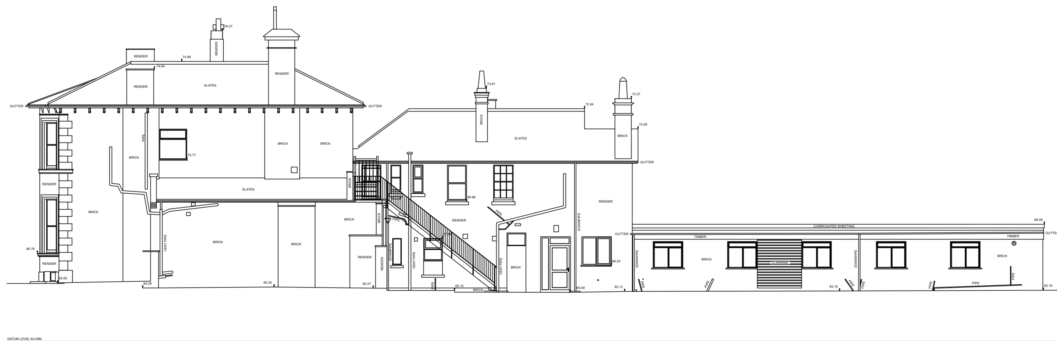
ASHLEY LODGE SOUTH ELEVATION (SIDE)