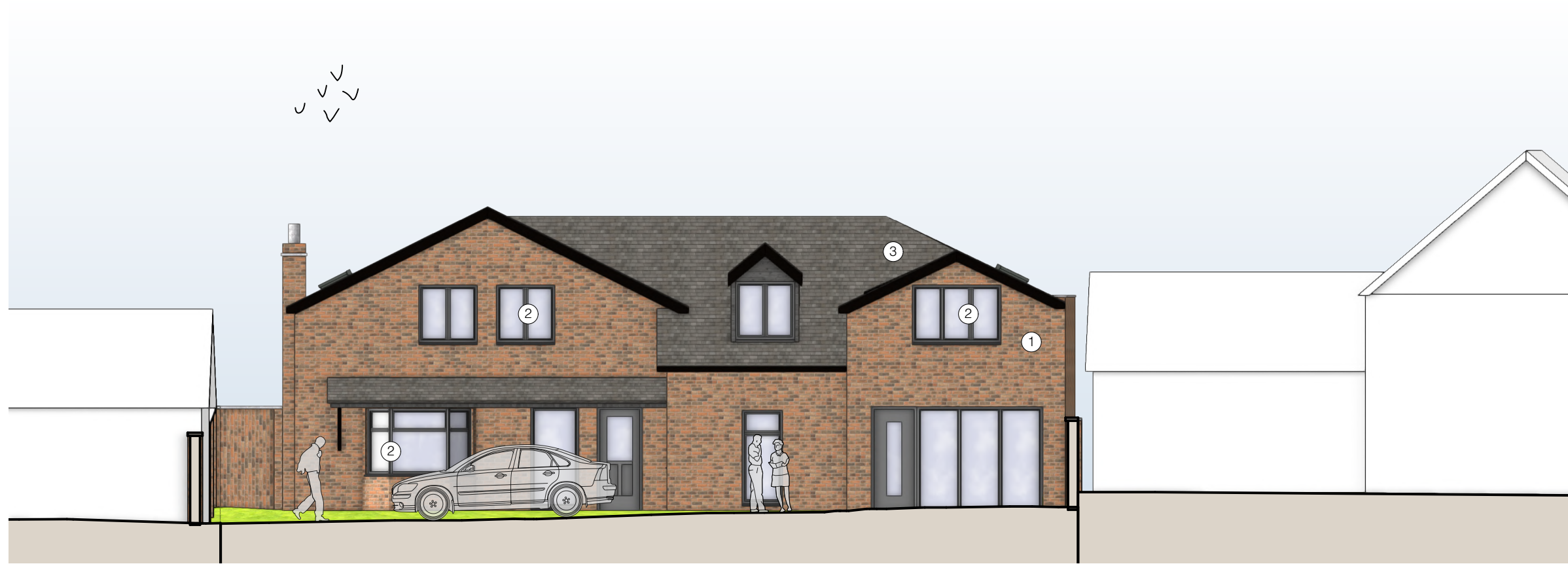
1 Proposed West Elevation Scale: 1:100