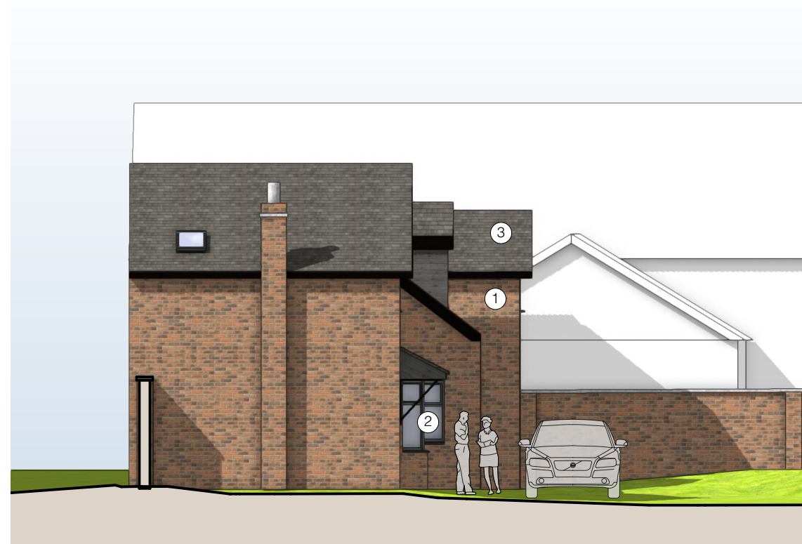
2 Proposed North Elevation Scale: 1:100