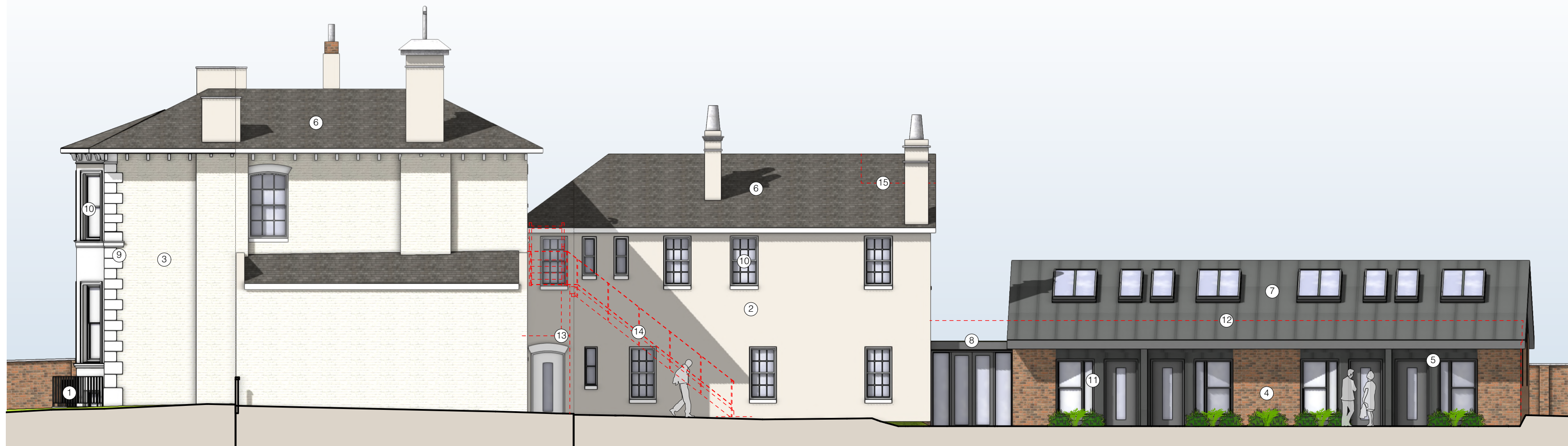
2 Proposed South Elevation Scale: 1:100