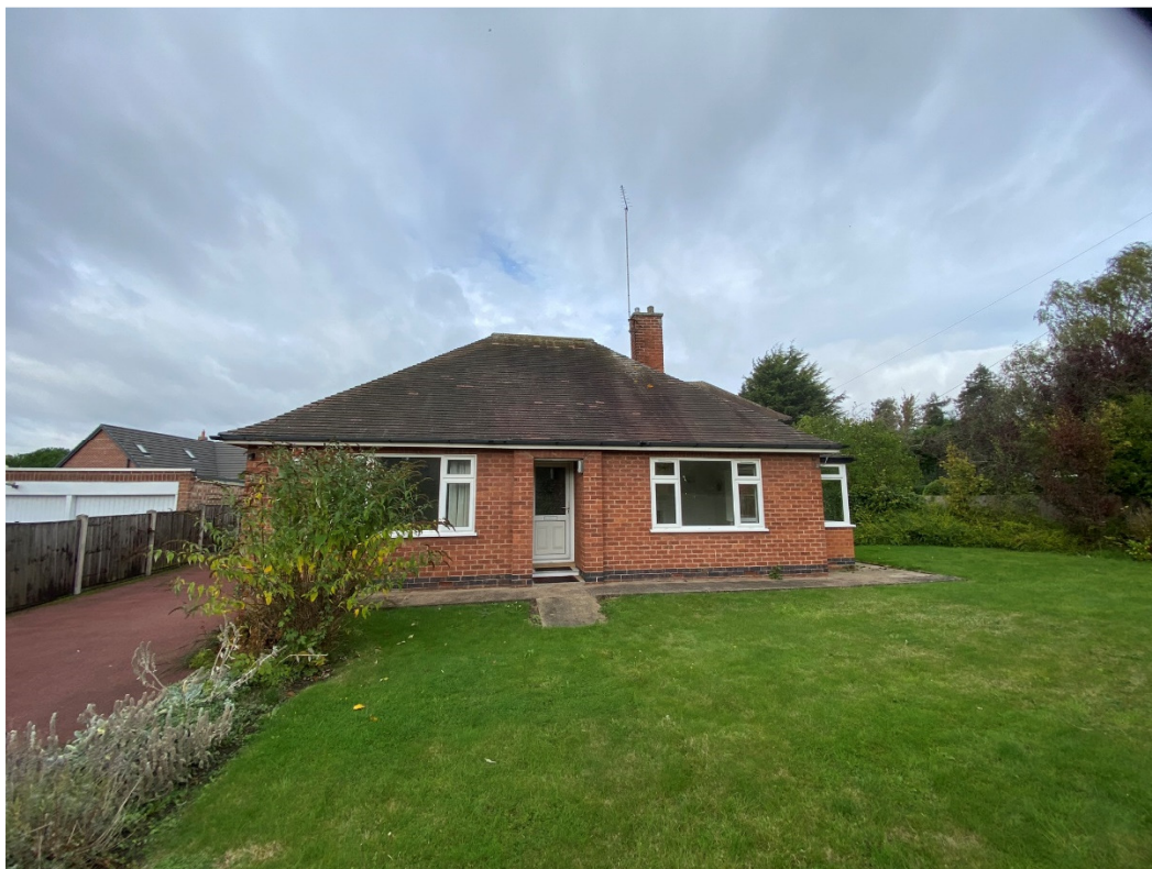
Existing front view of No 53 College Street, East Bridgford