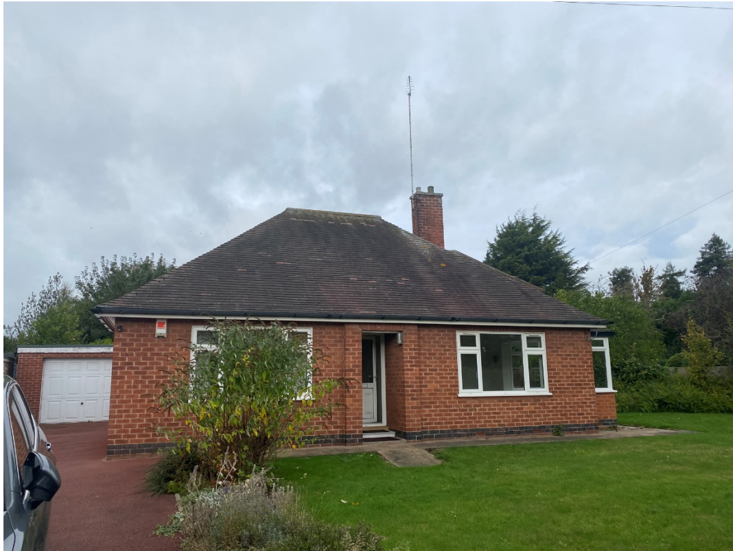
Existing front view of No 53 College Street, East Bridgford