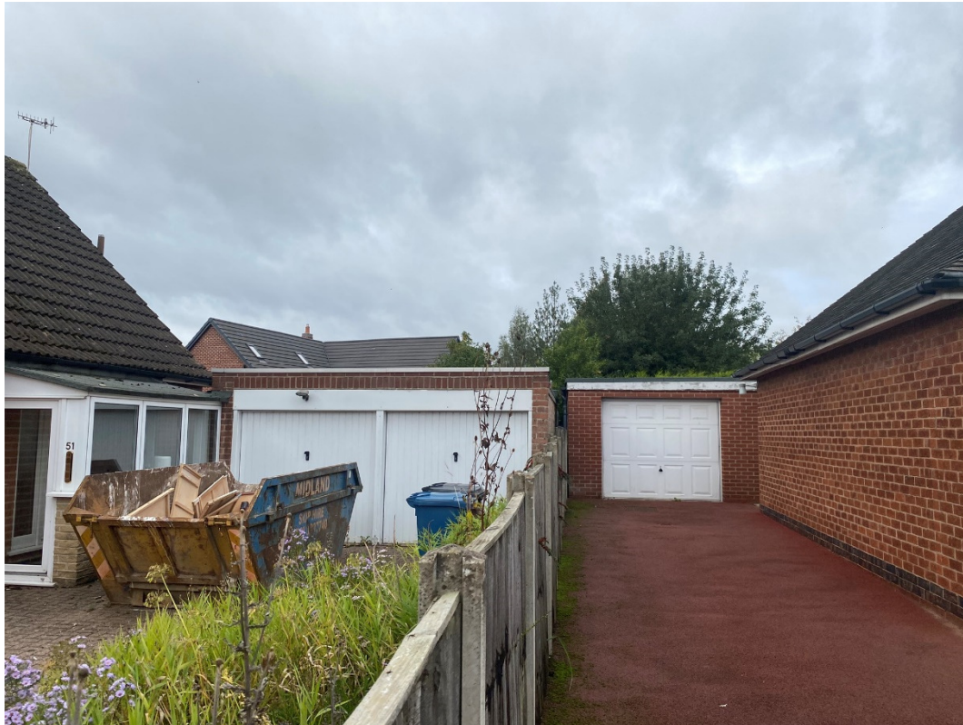
Existing view between No's 51/53

RDS Design Services (Bingham) Ltd Architectural Design Consultants 1 Betony Close, Bingham, Nottinghamshire, NG13 8TP