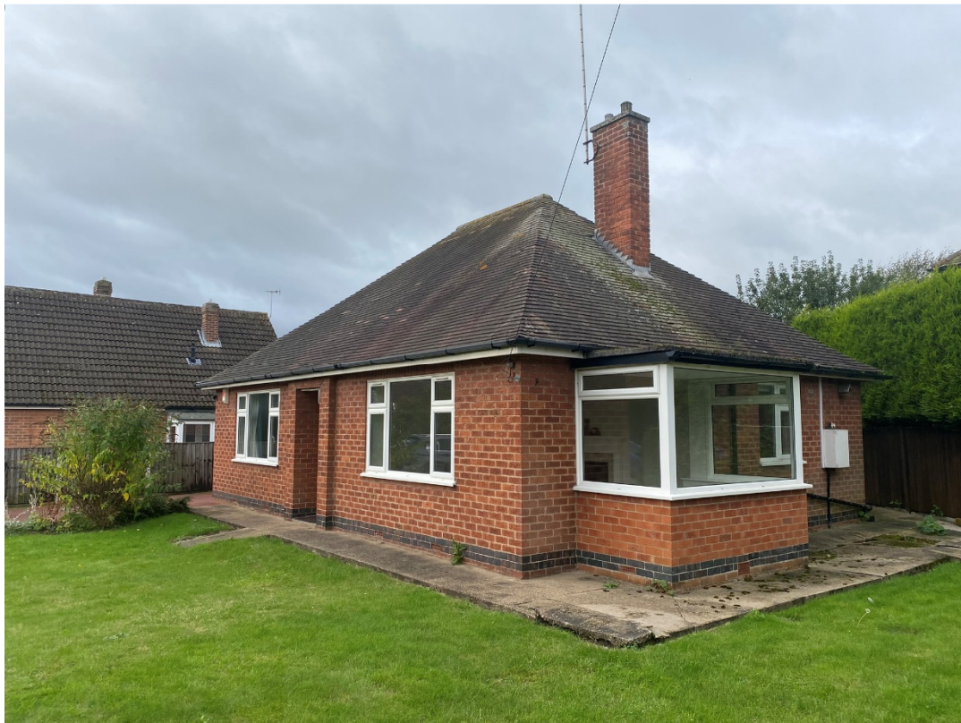
Existing front and side view of No 53 College Street, East Bridgford

Director RDS Design Services (Bingham) Ltd.