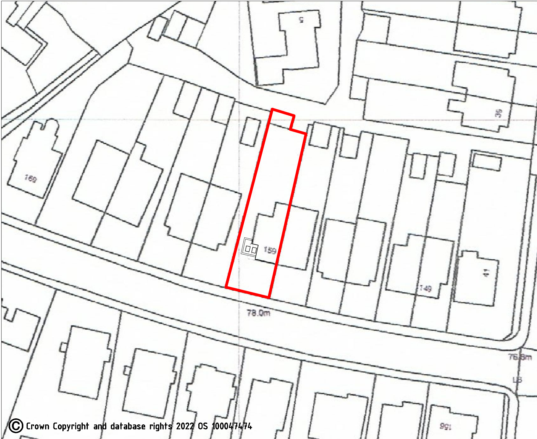
PROPOSED SITE PLAN 1:500