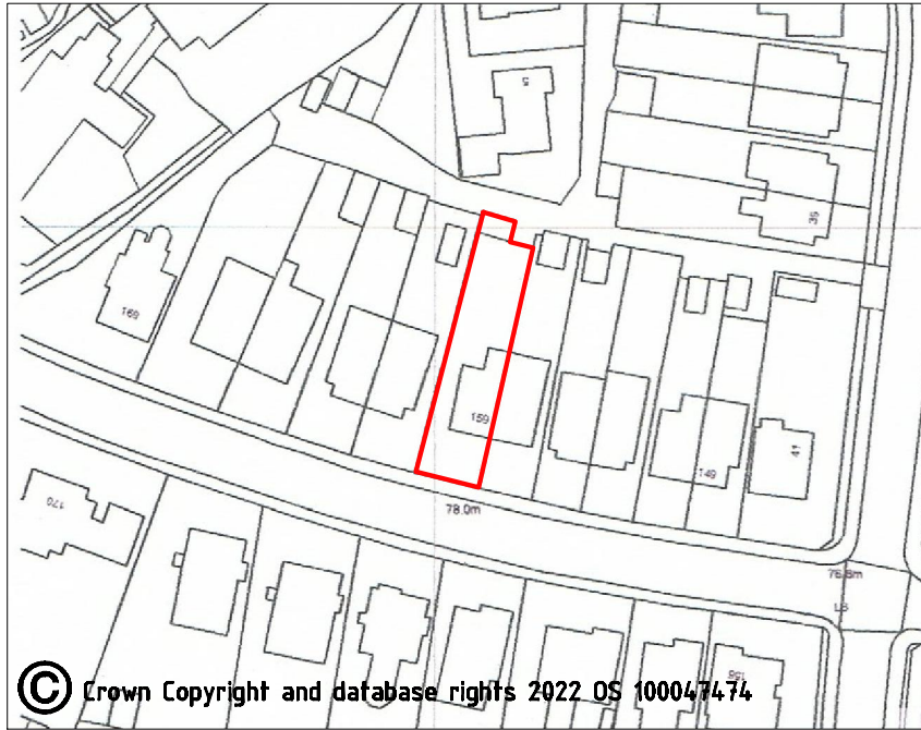
EXISTING LOCATION PLAN 1:1250