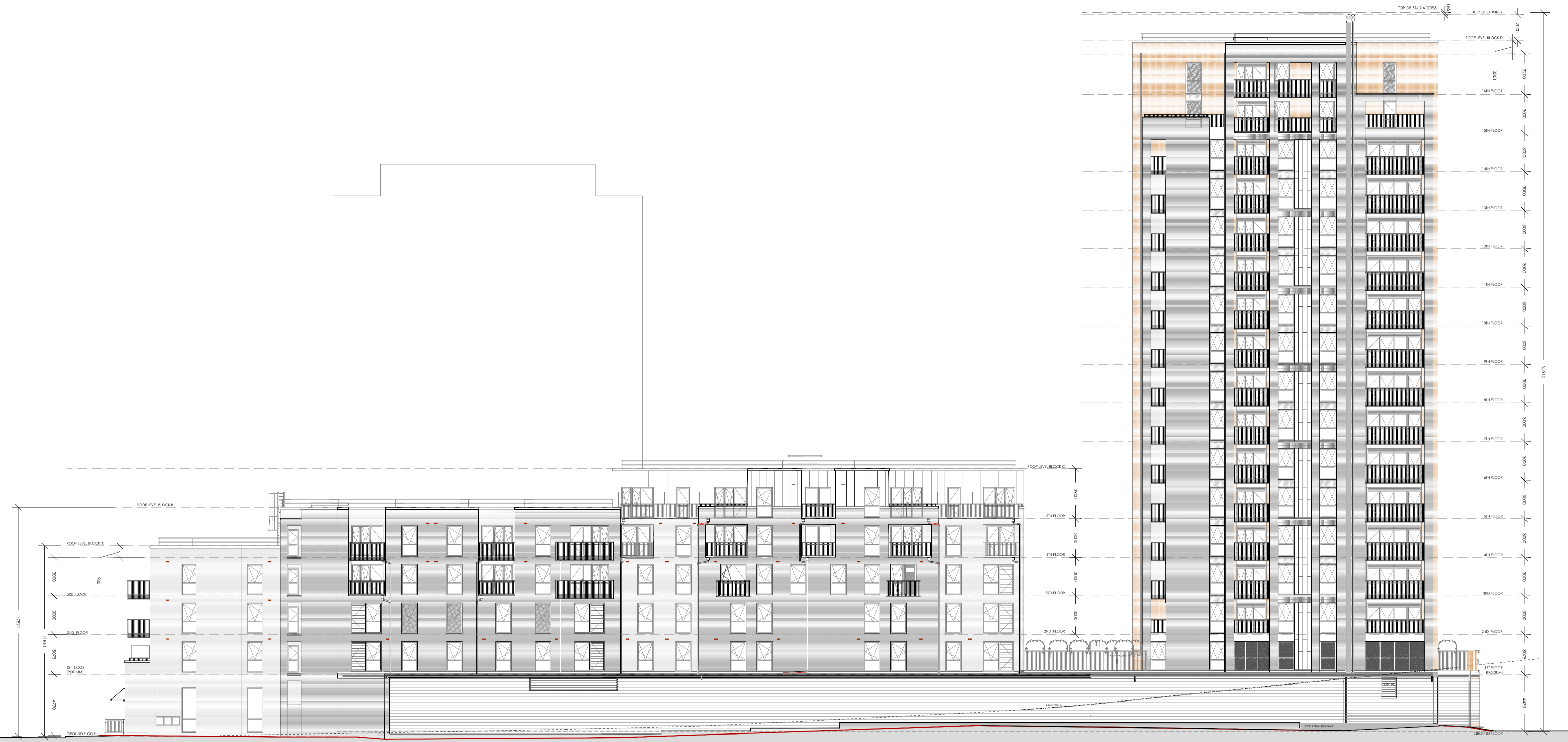
BLOCK A BLOCK B BLOCK C BLOCK D EAST ELEVATION - STREET DRAWING 138 (GA) 22-PL1